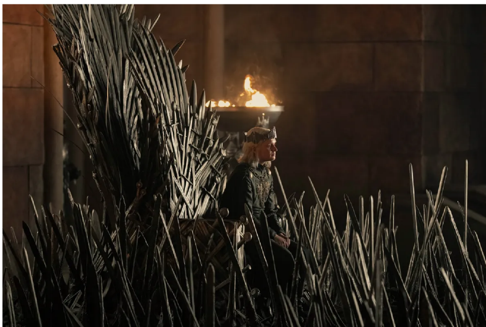
Warner Bros. Discovery

The battle for the Iron Throne is back. The return of House of the Dragon contributed to the largest single-day audience ever on Max. Still, the 7.8 million viewers were a 22% decline from last year. Don't worry, fans can try to top its debut again as the network has already ordered a third season.