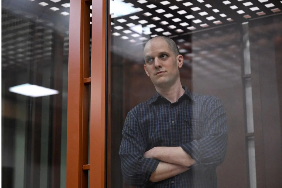
Natalia Kolesnikova/Getty Images