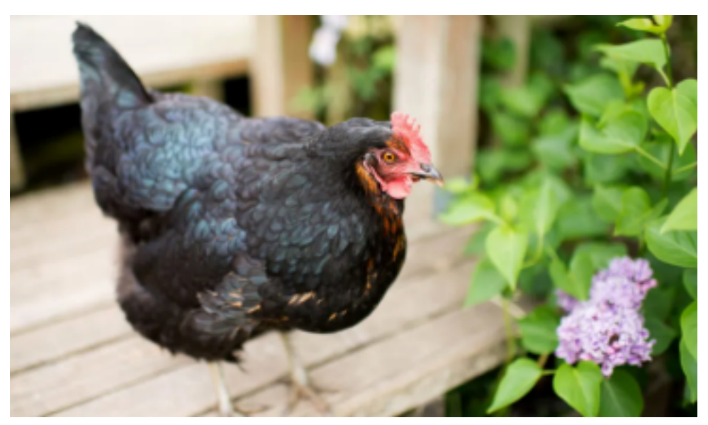
Black Jersey Giant

The Black Jersey Giant is a popular <u>large black chicken</u> <u>breed</u> with an average egg-laying capability.