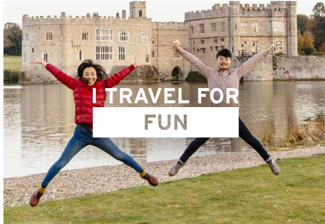
Couple jumping on a lawn by the moat at Leeds Castle near