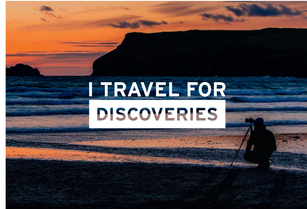
Go in search of the perfect seaside photo opportunity. Polzeath Beach, Cornwall, South-West England.