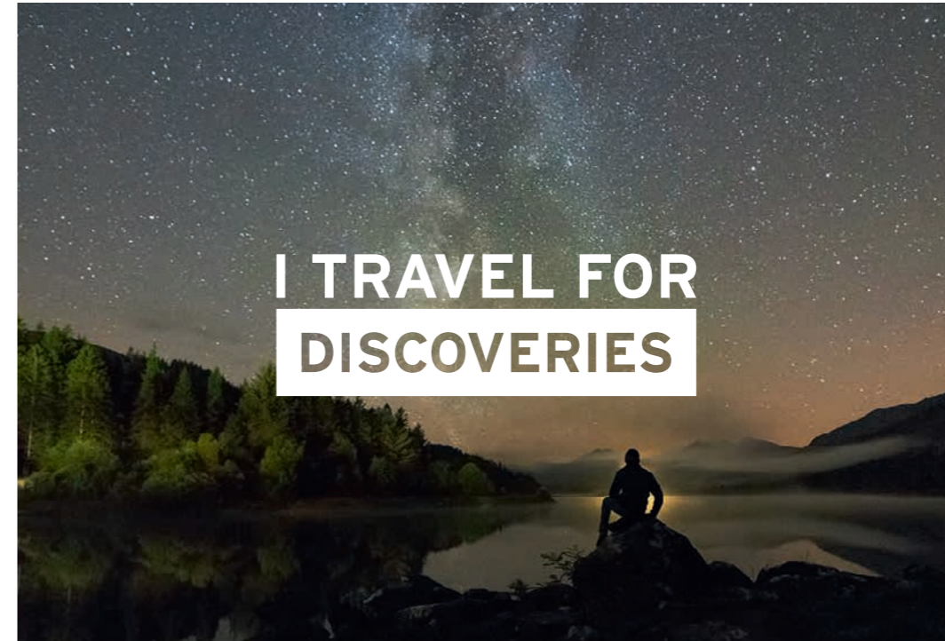
Spot a shooting star while stargazing in Snowdonia. Snowdonia International Dark Sky Reserve, Wales.