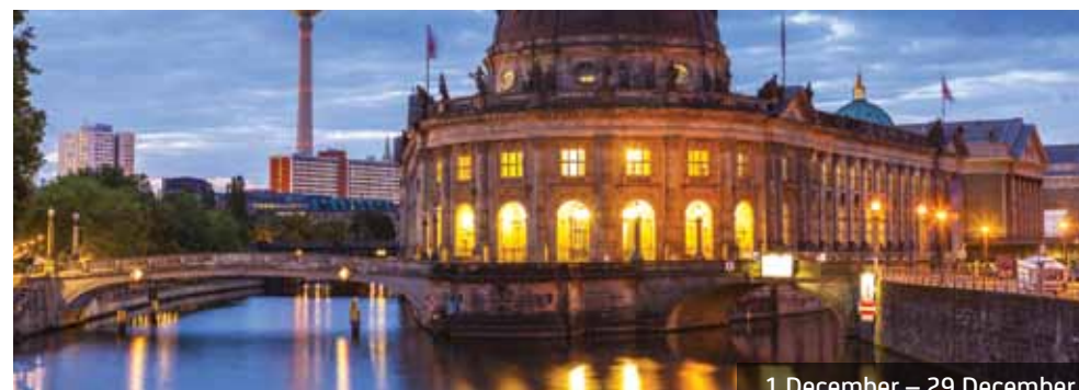
Berlin – Berlin Plaza Hotel