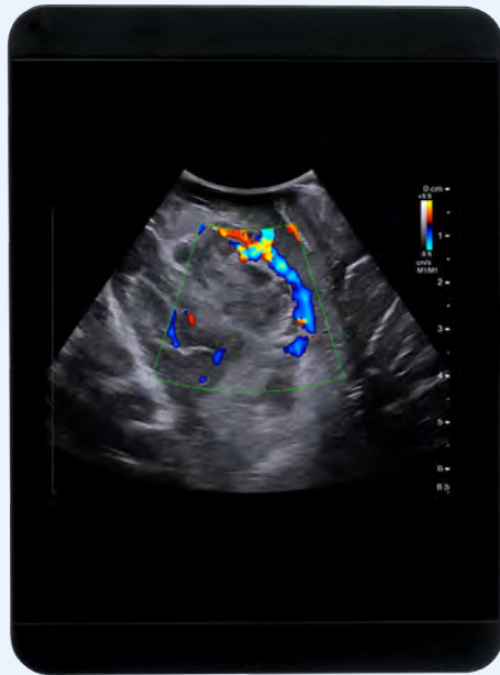
Hematoma due to AVM with color Doppler. N13C5 Transducer