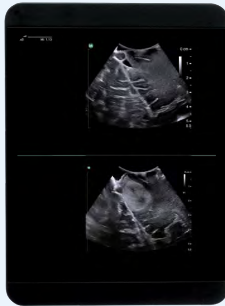
Metastatic lesion, Dual Live Compare. N13C5 Transducer