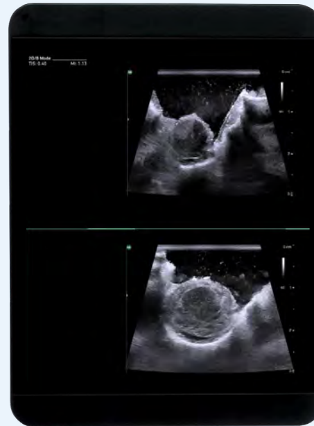
Spinal Decompression, Dual Live Compare. X18L5s** Transducer