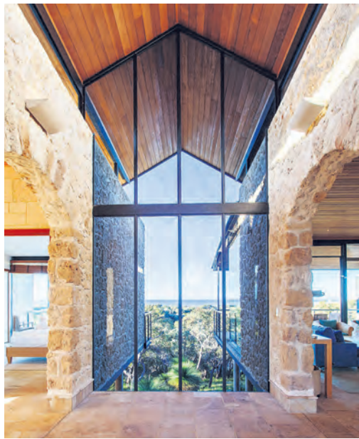
High points Farm Break, set on a hill overlooking Bunker Bay, offers stunning views in a beautiful home away from home.