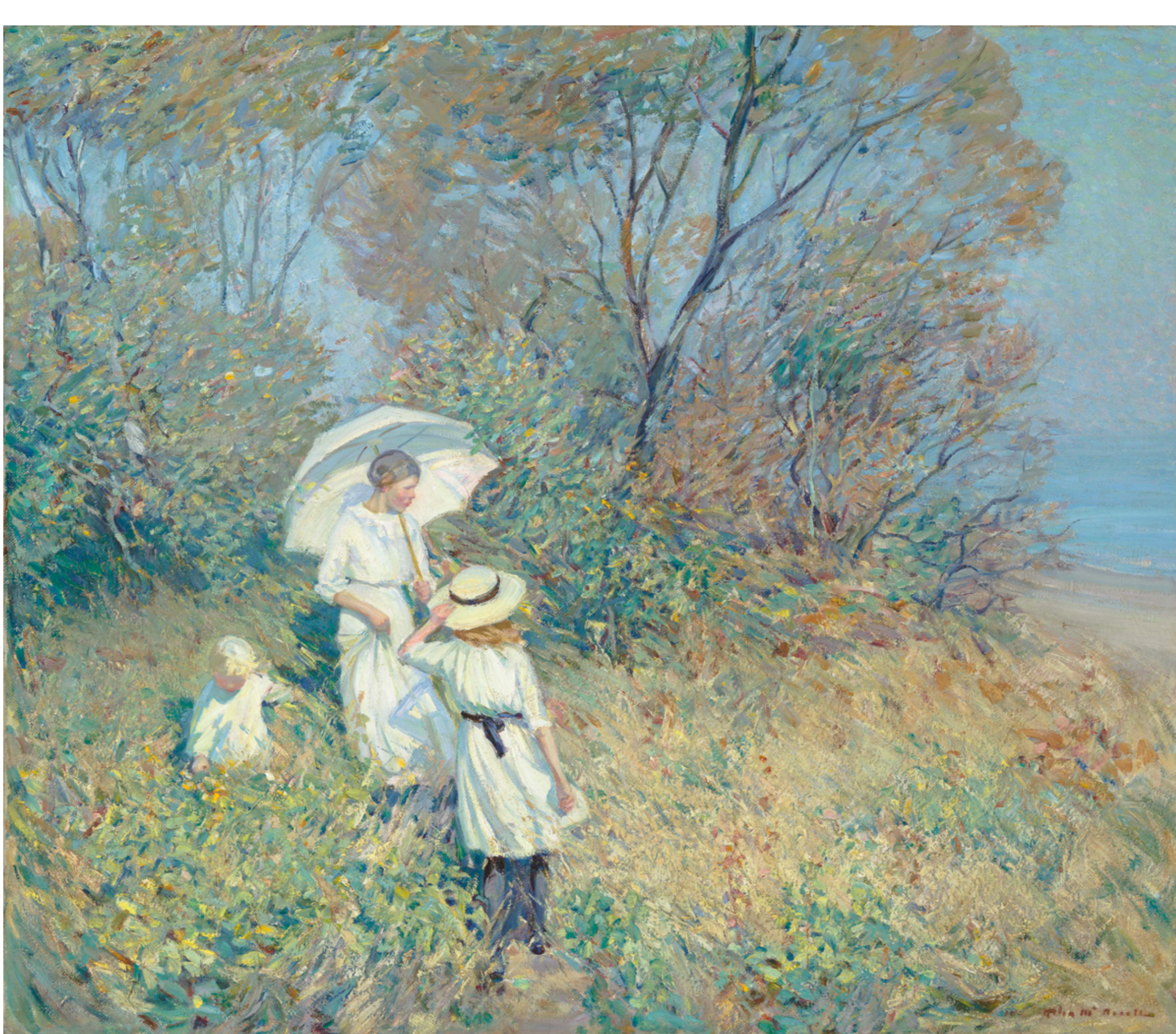
Helen McNicoll, Sunny September , 1913, oil on canvas, 92 x 107.5 cm. Collection of Pierre Lassonde.