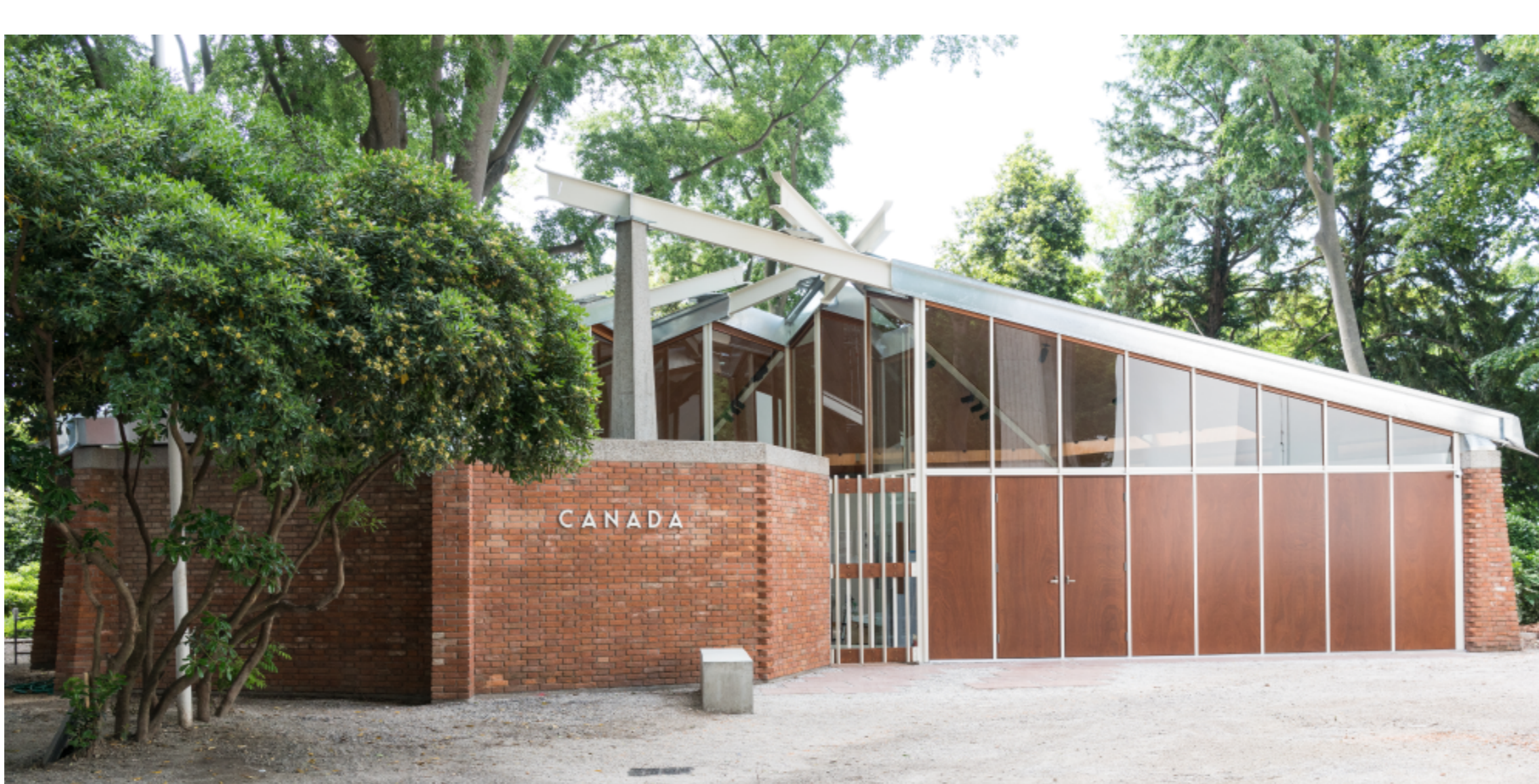
Canada Pavilion, view of newly restored pavilion, 2018, Giardini di Castello, La Biennale di Venezia, Venice.

As the opening of the 59th Venice Biennale international art exhibition fast approaches, the Foundation eagerly anticipates the unveiling of the National Gallery of Canada's commission from contemporary artist Stan Douglas, who was selected to represent Canada this year.