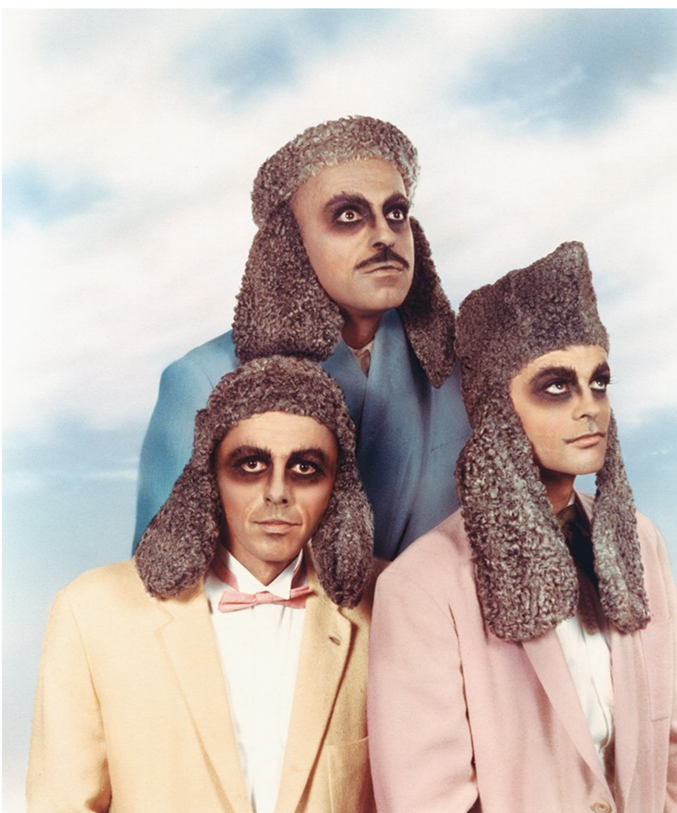
General Idea, P is for Poopie , 1983. © General Idea. Photo: Courtesy the artist

The Foundation continues to work towards its $300,000 fundraising goal in support of the National Gallery of Canada's ambitious 2022 summer exhibition, General Idea .