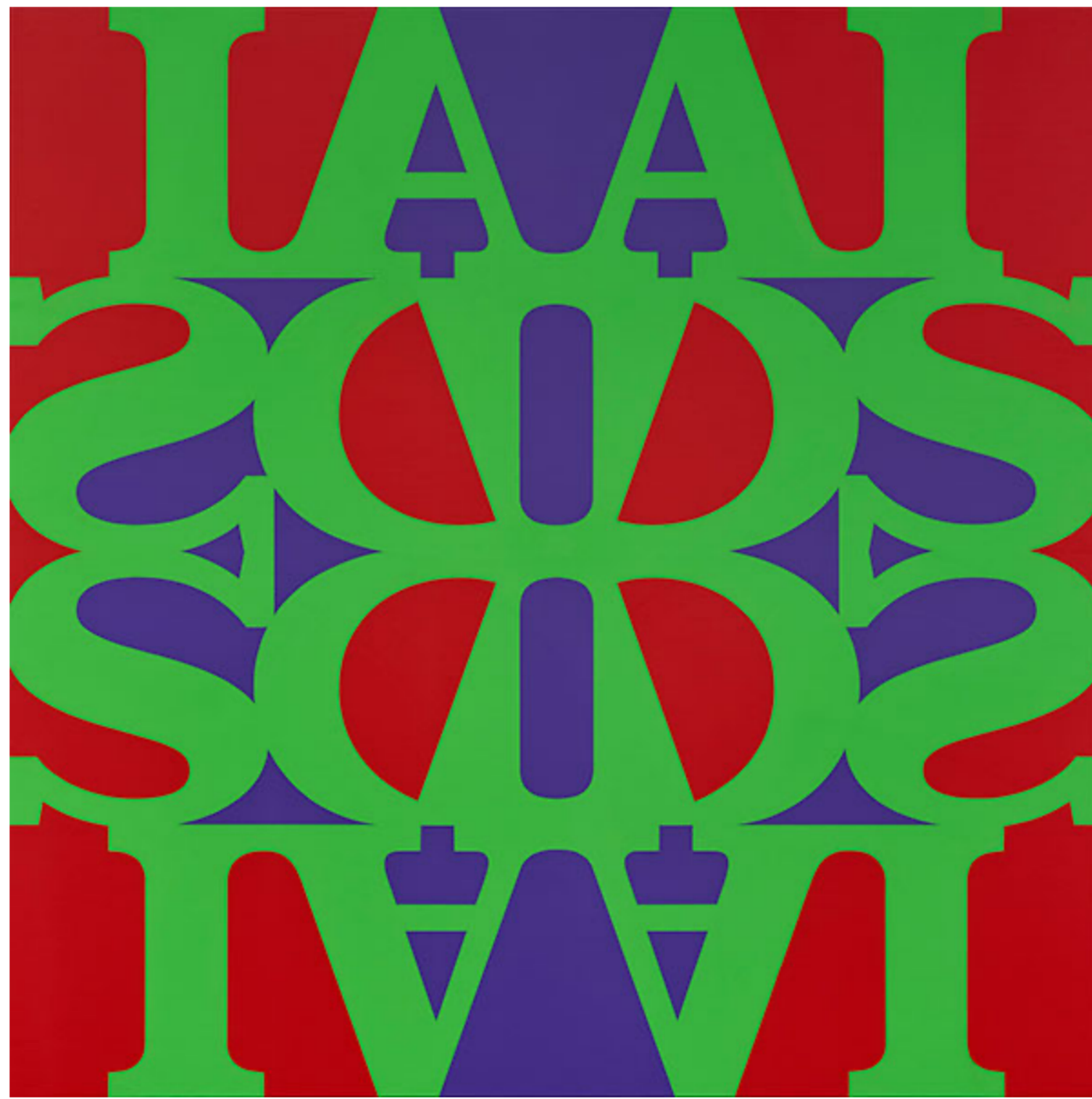
AA Bronson and General Idea, Great AIDS (Carmine Green Yellow), 1990/2018, acrylic on linen, 150.1 x 150.1 x 4.8 cm. National Gallery of Canada, Ottawa. Purchased 2018 © AA Bronson and General Idea.

In the most comprehensive retrospective on the trio ever produced, the National Gallery of Canada brings together over 200 works exploring General Idea's career, from their early days emerging from late 1960s counterculture, to the acclaimed IMAGEVIRUS series which permeated the media landscape in the late 1980s, and which culminated in the deeply moving final works of their last years.