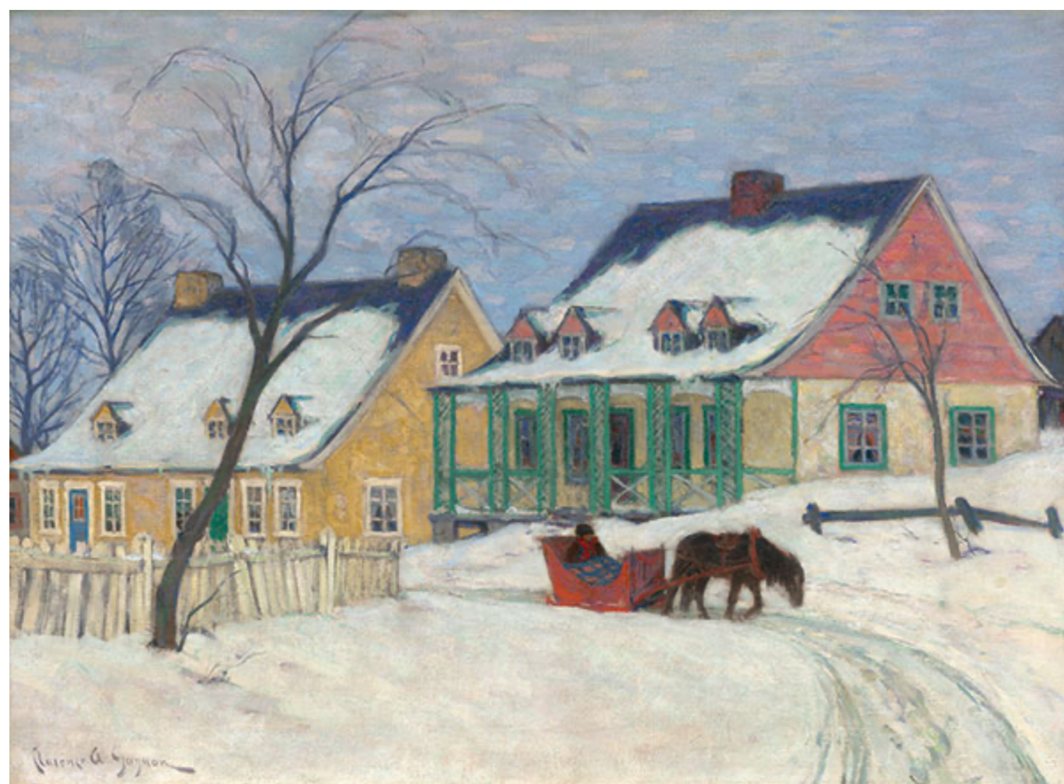
Clarence Gagnon, Old Houses, Baie-Saint-Paul, c. 1912, oil on canvas, 52.5 x 72.5 cm. Private Collection, Toronto.

Heralded as groundbreaking by the prestigious Burlington Magazine, Canada and Impressionism: New Horizons opens its doors for the last time on 21 January 2022, on its return home from its acclaimed European tour.