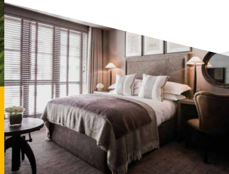
Clockwise from top: Moxy Hotel Merchant City; Radisson Red; The Clydeside Distillery; Dakota Deluxe