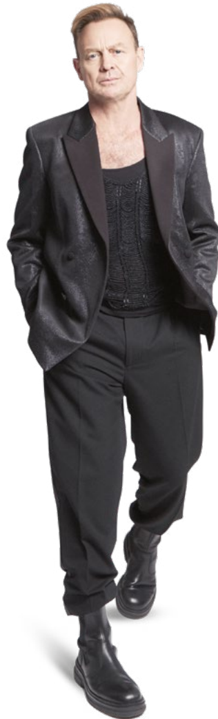
Jason Donovan, 55 NATIONAL TREASURE