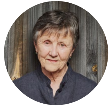
Helen Garner, 81 WONDROUS WORDSMITH

He hit new heights in 2023 with an induction into the Nashville Songwriters Hall of Fame. “Being invited into the Hall of Fame is hands down one of the highest honours that’s ever happened to me,” says Keith, who is also set to release a new studio album – his first since 2020 – this year. “The songs are about hope, wild longing, working through things, and just sheer, mindless fun,” he says.