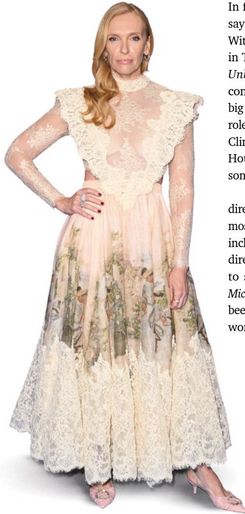
Toni Collette, 51 SCREEN QUEEN

His wicked sense of humour shines through in his work, which includes picture books, junior novels and collaborations with top Australian authors, including Andy Griffiths. The pair’s hugely popular Treehouse series has sold over 10 million copies in Australia and is on the shelves in more than 35 countries. Andy is one of his biggest fans. “To sit beside Terry while he is drawing is amusing and mysterious in equal parts,” he says. “He seems to literally ‘think’ through the drawing process itself.”