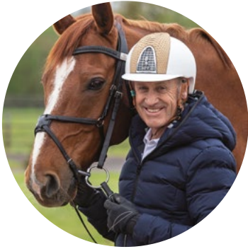
Andrew Hoy, 65 RIDING HIGH

A ndrew may be one of Australia's most successful athletes, with six Olympic medals – including three gold – but the equestrian never worries he'll become too big for his riding boots. "Working with horses keeps you humble," he tells DARE. "You have to build credibility and respect afresh with every animal in a clear way each time."