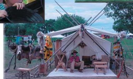
Life in Adams County as a mountain man.