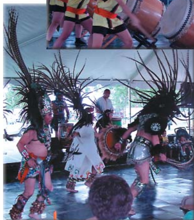
Grupo Huitzilopochtli is a colorful Aztec music and dance group, which focuses on teaching the ancient Mexican culture through their performances.