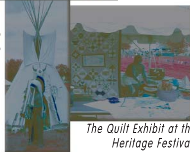
The Quilt Exhibit at the Heritage Festival.