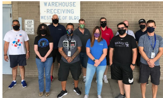
Print Shop/Copier Team Quail Building