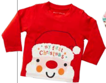
My First Christmas T-Shirt, £2