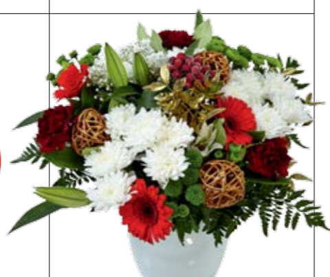
Luxury Christmas Bouquet, £15 Available from 1 December