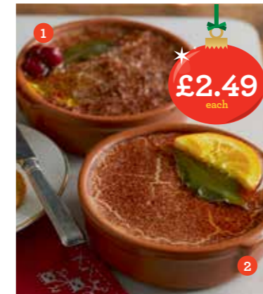
1. Ardennes Pâté , available from deli express, £2.49 , 240g (£1.04/100g) 2. Brussels Pâté , available from deli express, £2.49 , 240g (£1.04/100g) Both available from 8 December