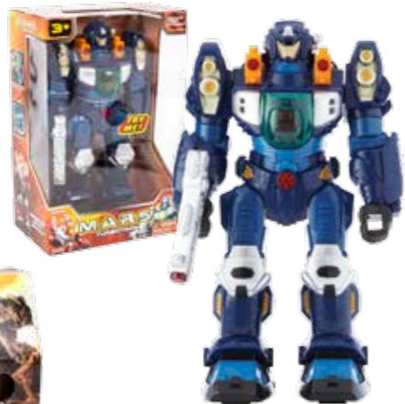
Mars Turbotron Robot, £10