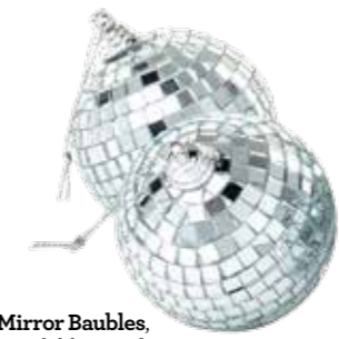
Silver Mirror Baubles, also available in red, £2, 6 pack