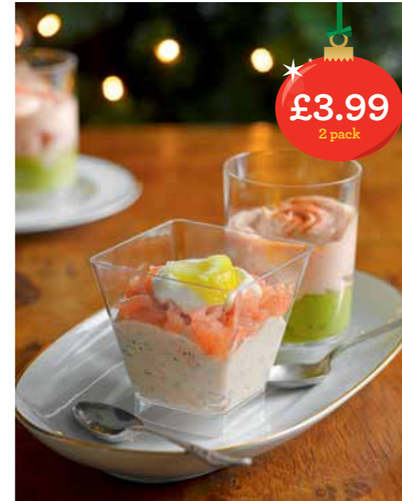
Smoked Salmon Cocktails , smoked salmon and honey roast hot smoked salmon mousse, layered with smoked salmon and topped with tangy lemon mousse, 2 pack, £3.99 , 180g (£2.22/100g); Prawn Cocktails , layers of avocado, prawns and Marie Rose sauce, seasoned with lemon, 2 pack, £3.99 , 180g (£2.22/100g) Both available from 22 December