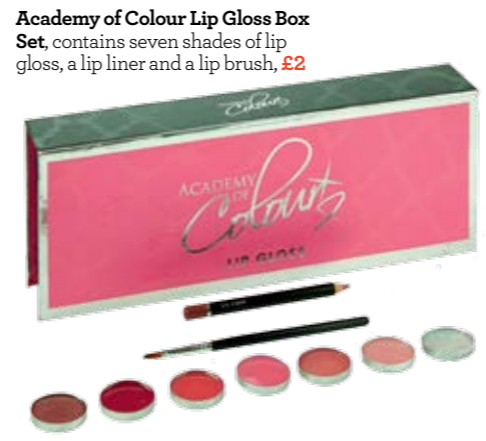
Academy of Colour Lip Gloss Box Set , contains seven shades of lip gloss, a lip liner and a lip brush, £2