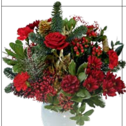
Winter Warmer Bouquet, £10 Available from 1 December