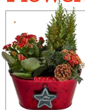
Festive Planter, £5 Available from 10 November

Our florists have created fantastic festive blooms to brighten your home this Christmas