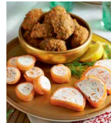
Smoked Salmon Bites , filled with cheese & chive or salmon mousse, £2.99 , 12 pack; Mini Fishcake Selection , with crab & chilli and salmon & dill, £2.49 , 12 pack; Smoked Salmon Crescents , filled with smoked salmon and honey roast hot smoked salmon mousse, £3.99 , 8 pack All available from 26 November