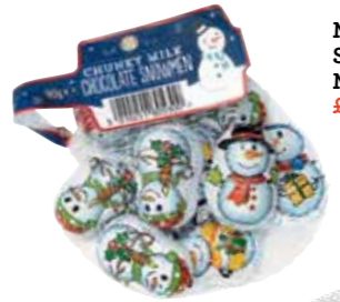
M Chocolate Snowmen or M Stuffed Santas , £1 per pack, 90g