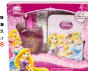
Disney Princess Eau De Toilette and Keepsake Tin Gift Set, £5 or 2 FOR £8