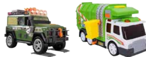
Garbage Truck or Army 4x4, £10 each