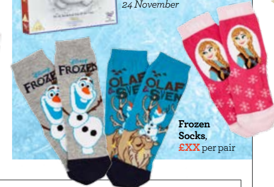
Frozen Socks, £XX per pair