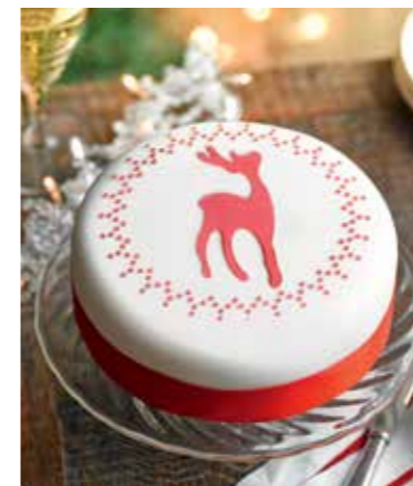
Fully Iced Christmas Cake , packed with sultanas soaked in orange juice for extra festive flavour, mixed with sticky glacé cherries and zesty citrus peel, £4.99