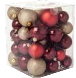
Mixed Red Baubles, also available in silver or brights, £5, 60 pack