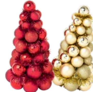
Red or Gold Bauble Tree, £5 each. Also available: Red Berry Wreath, Red Bauble Wreath and Silver & Gold Bauble Wreath, £5 each