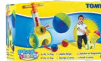
Tomy Pic N Pop, £10