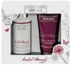
Baylis & Harding Skin Spa Small Gift Set , £3