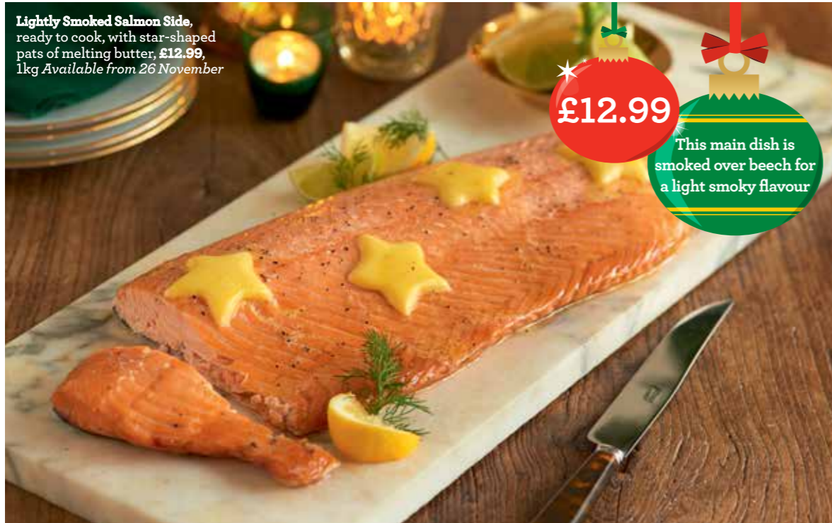
Lightly Smoked Salmon Side , ready to cook, with star-shaped pats of melting butter, £12.99 , 1kg Available from 26 November