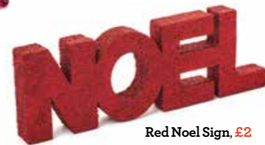
Red Noel Sign, £2