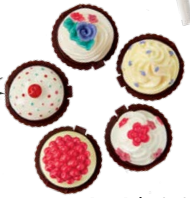
Beauty Parlour Cup Cake Lip Balm Collection , £4