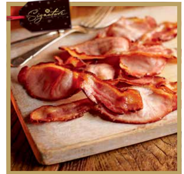
M Signature Christmas Tree Smoked British Back Bacon , succulent dry-cured back bacon, smoked over spruce chips for a fragrant, festive flavour, £2.99 , 200g (£14.95/kg) or 2 FOR £5 Available from 10 November