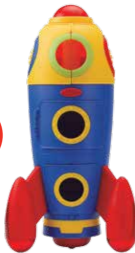
Space Family Rocket, £10