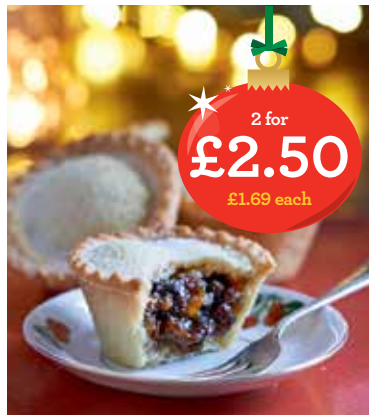
Luxury Deep Filled Mince Pies , £1.69 , 4 pack (42.3p each) or 2 FOR £2.50