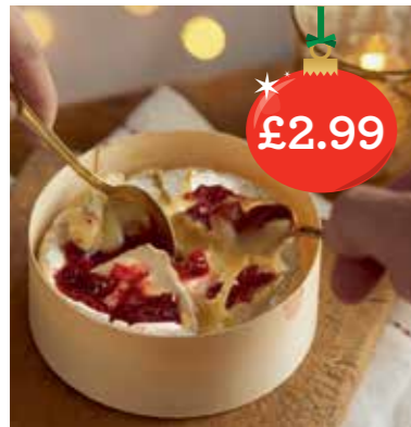
Baking Camembert with a Cranberry & Clementine Sauce , perfect for sharing: a baking Camembert with sauce sachet to be added before baking, £2.99 , 290g (£10.31/kg). Also available: Baking Camembert with a Bacon, Onion & Garlic Chutney , with chutney for baking, £2.99 , 290g (£10.31/kg) Both available from 8 December