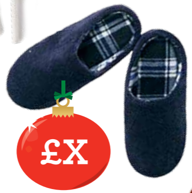
Nutmeg Men's Slippers , £XXX