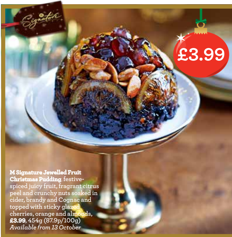
M Signature Jewelled Fruit Christmas Pudding , festive-spiced juicy fruit, fragrant citrus peel and crunchy nuts soaked in cider, brandy and Cognac and topped with sticky glazed cherries, orange and almonds, £3.99 , 454g (87.9p/100g) Available from 13 October

M Signature Thick Honey and Whisky Flavoured Cream , made with luxurious Channel Island cream, £2.50 , 250ml (£1/100ml)