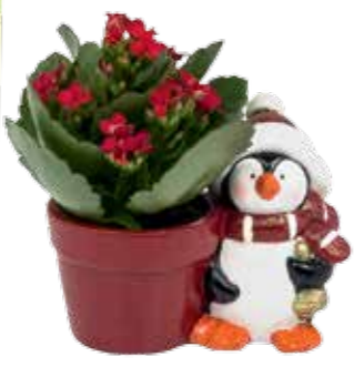
Santa's Little Helper , £2 Available from 10 November