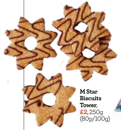
M Star Biscuits Tower , £2 , 250g (80p/100g)