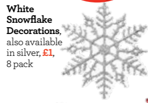
White Snowflake Decorations, also available in silver, £1, 8 pack