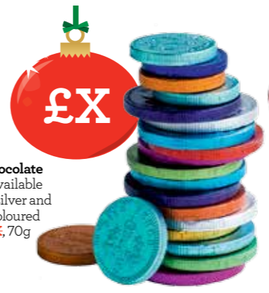
Milk Chocolate Coins , available in gold, silver and mixed coloured foil, £XX , 70g