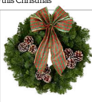
Christmas Wreath with Tartan Bow, £7 Available from 17 November