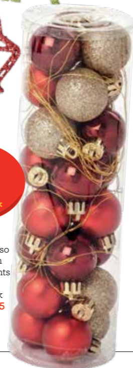
Mini Red Baubles, also available in silver, brights or pastels, £2, 24 pack or 3 FOR £5