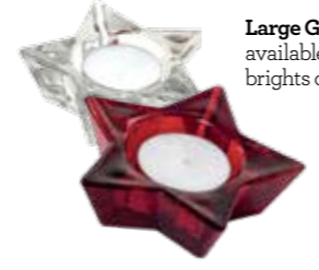
Large Gold Baubles, also available in silver, red, plum, brights or pastels, £3, 6 pack