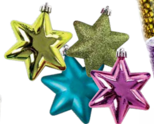
Brights Star Baubles, also available in gold, red or silver, £2, 6 pack or 3 FOR £5