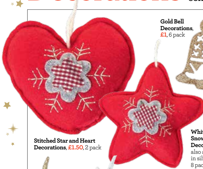
Stitched Star and Heart Decorations, £1.50, 2 pack