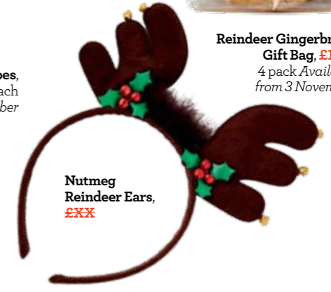
Nutmeg Reindeer Ears , £XX