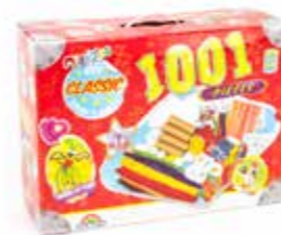
My Mega Box Craft Kit, £10