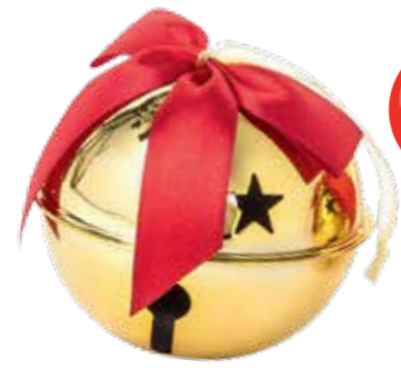
Gold and Silver Bells, available in two sizes: large, £3, 2 pack; small, £3, 6 pack