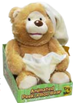
Animated Peek a Boo Bear, £10