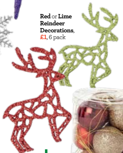
Red or Lime Reindeer Decorations, £1, 6 pack