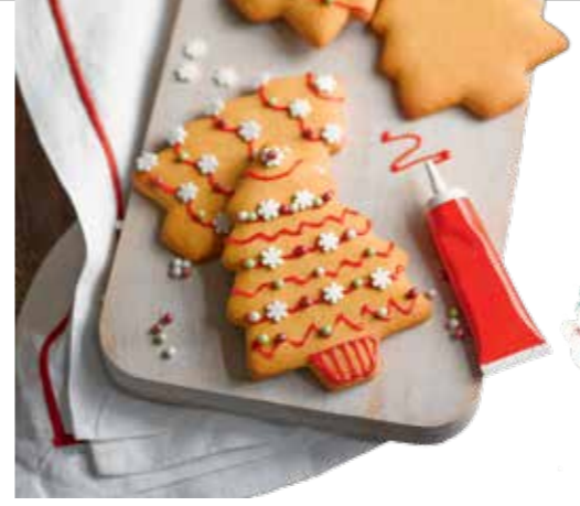
Decorate Your Own Gingerbread Christmas Tree , £1.49 , 5 pack Available from 3 November