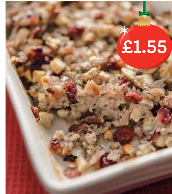
Butcher's Style Pork, Apple & Cranberry Stuffing , £1.55 , 454g (£3.42/kg). Also available: Butcher's Style Pork, Sage & Onion Stuffing , £1.55 , 454g (£3.42/kg) Both available from 1 December