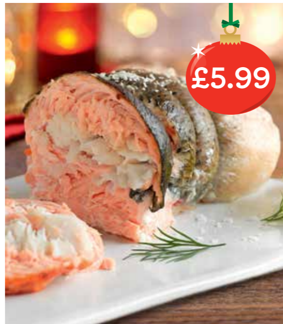
Three Fish Roast , cod and smoked haddock fillet wrapped in salmon fillet with lemon and parsley butter, £5.99 , 550g (£1.09/100g)

Hand-crafted in store by our expert fishmongers