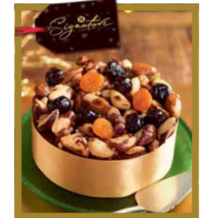
M Signature Jewelled Fruit & Nut Christmas Cake , packed with fruit and nuts, hand-finished with glazed cherries, apricots, almonds, walnuts, pistachios and Brazils, £7.99 Available from 3 November