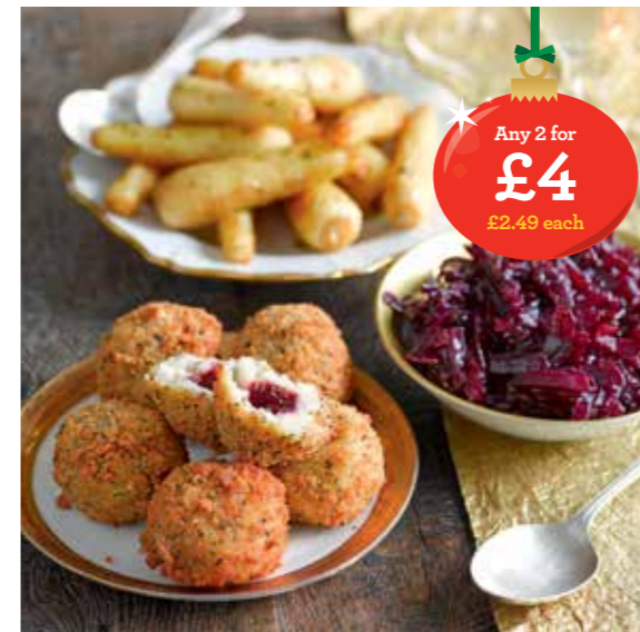
M Signature Baby Parsnips with a Thyme Butter Glaze , tender British baby parsnips, £2.49 or 2 FOR £4 ; M Signature Slow Braised Red Cabbage with Beetroot & Cranberries , cooked with cinnamon and cloves, £2.49 or 2 FOR £4 Both available from 1 December; Cranberry & Sage Christmas Croquettes , made with fluffy mashed potato and a sweet cranberry centre, £2 , 360g (55.6p/100g) Available from 8 December