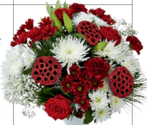
Jingle Bells Bouquet, £20 Available from 15 December

It's beginning to look a lot like Christmas