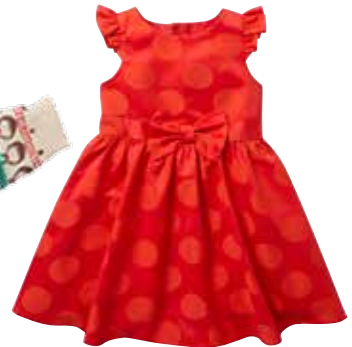
Red Spot Jacquard Dress, £10/£12