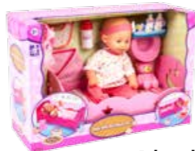
Baby with Bed Deluxe Set, £10