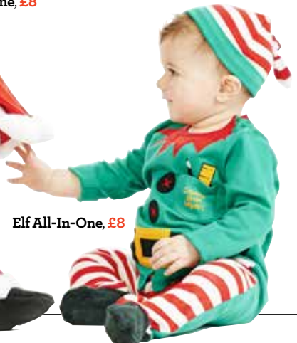
Elf All-In-One, £8