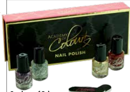
Academy of Colour Nail Polish Box Set , contains four nail varnishes and two emery boards, £2