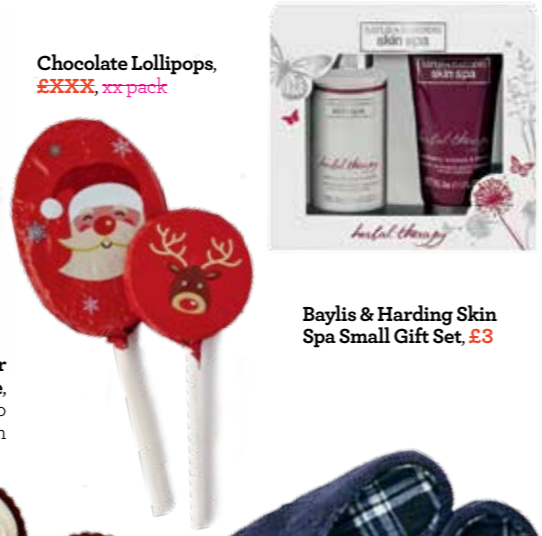
Chocolate Lollipops , £XXX , xx pack