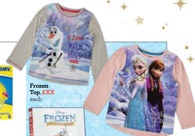
Frozen Top, £XX each