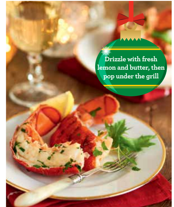
Lobster Tails , £5.99 , 90g (£6.66/100g)