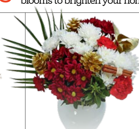
Festive Cheer Bouquet, £5 Available from 1 December