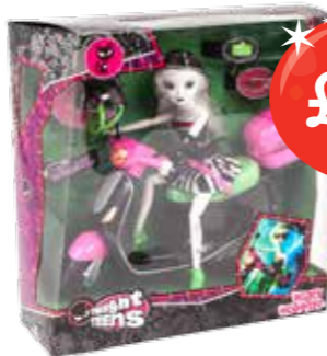
Twilight Teens Scary Scooter, £10