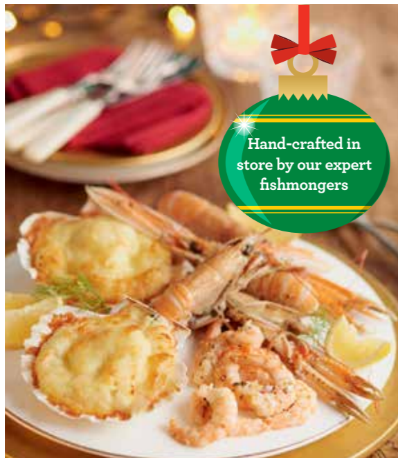
Shellfish Platter , with king prawns, langoustines and Coquilles St Jacques, £5.99 , 500g (£1.20/100g) Available from 26 November

This main dish is smoked over beech for a light smoky flavour