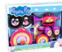
Peppa Pig Musical Band Set, £10