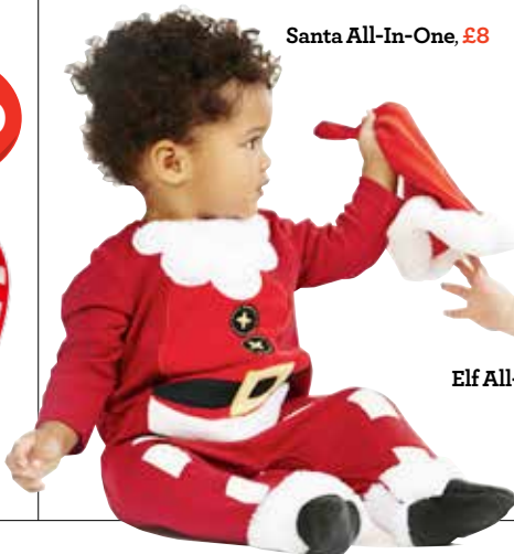
Santa All-In-One, £8