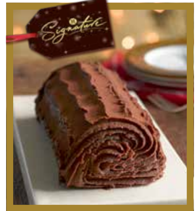
M Signature Triple Belgian Chocolate Fudge Yule Log , hand-rolled chocolate sponge packed with chocolate-flavoured buttercream and chocolate sauce, with milk chocolate fudge icing, £3.49 Available from 26 November