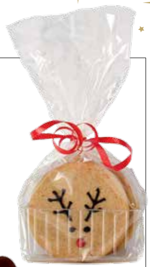
Reindeer Gingerbread Gift Bag , £1.49 , 4 pack Available from 3 November