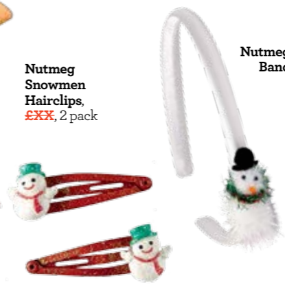
Nutmeg Snowmen Hairclips , £XX , 2 pack