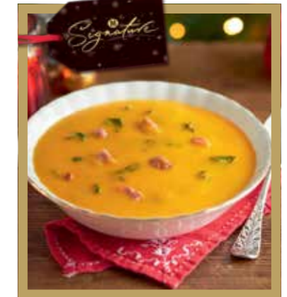
M Signature Christmas Tree Smoked Ham & Roasted Vegetable Soup , with carrots, onions, parsnips and cream, and packed with bacon lardons, £1.69 , 600g (28.2p/100g). Also available: Parsnip, Apple & Honey Soup , £1.39 , 600g (23.2p/100g) Both available from 10 November