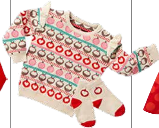
Product Name, lorem ipsum dolor, £XX