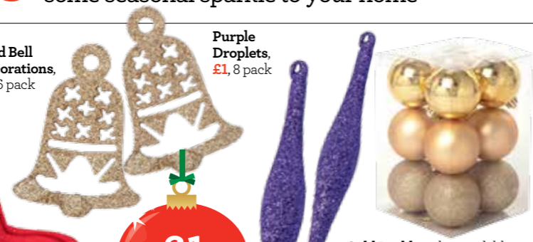
Gold Bell Decorations, £1, 6 pack