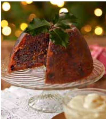
Rich Fruit Christmas Pudding , the perfect end to your festive feast, £3.99 , 907g (44p/100g). Also available: 99p , 100g; £2.50 , 454g (55p/100g) Available from 13 October