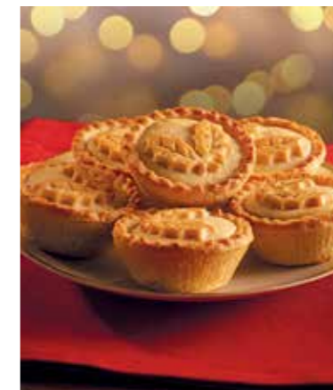
Fruity Festive Mince Pies , shortcrust pastry packed with sweet, plump festive fruit, £1 , 6 pack (16.7p each)