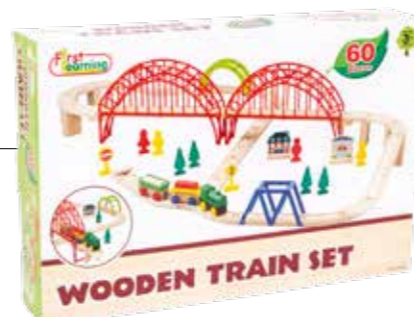
First Learning Wooden Train Set, £10