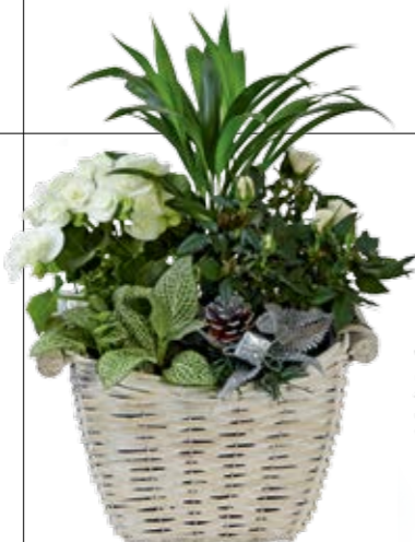
Luxury Basket, £15 Available from 8 December