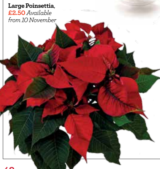
Large Poinsettia , £2.50 Available from 10 November