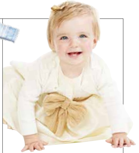
Ivory Party Dress with Gold Bow, £10