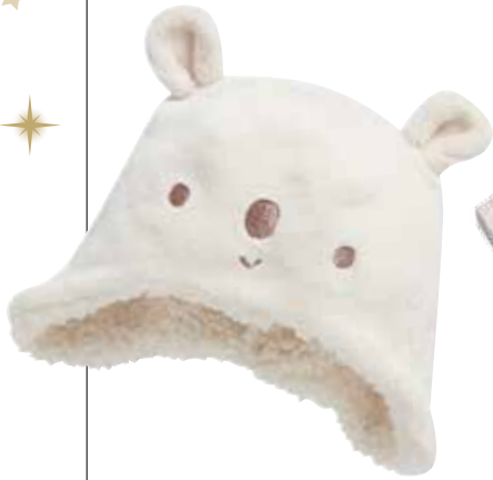
Unisex Koala Hat, £3

Cute, cuddly and easy-care babywear from £2.50