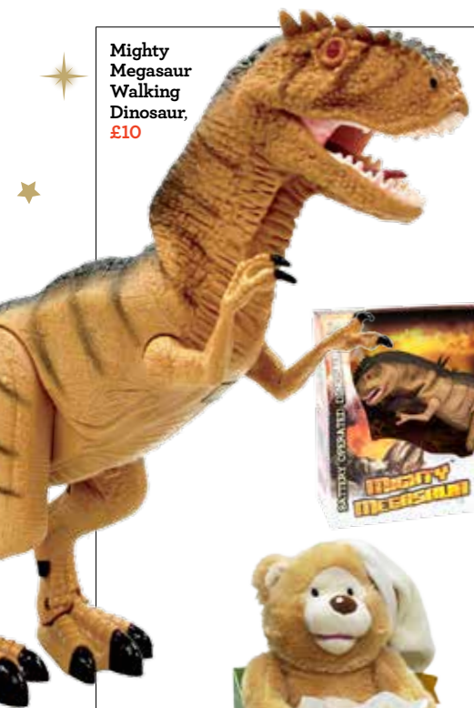
Mighty Megasaur Walking Dinosaur, £10