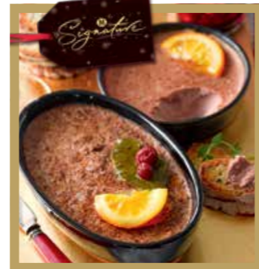
M Signature Ceramic Oval Venison Pâté with Mandarin Liqueur , £3 , 275g (£1.09/100g); M Signature Duck Pâté with Clementine Confit , £2 , 180g (£1.12/100g). Also available: M Signature Ceramic Oval Duck Pâté with Apple Jelly , £3 , 275g (£1.09/100g); M Signature Brussels Pâté with Garlic & Wild Mushroom , £2 , 180g (£1.12/100g). All available from 8 December