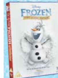
Frozen Sing-a-Long Special Edition, see in store for price Available from 24 November