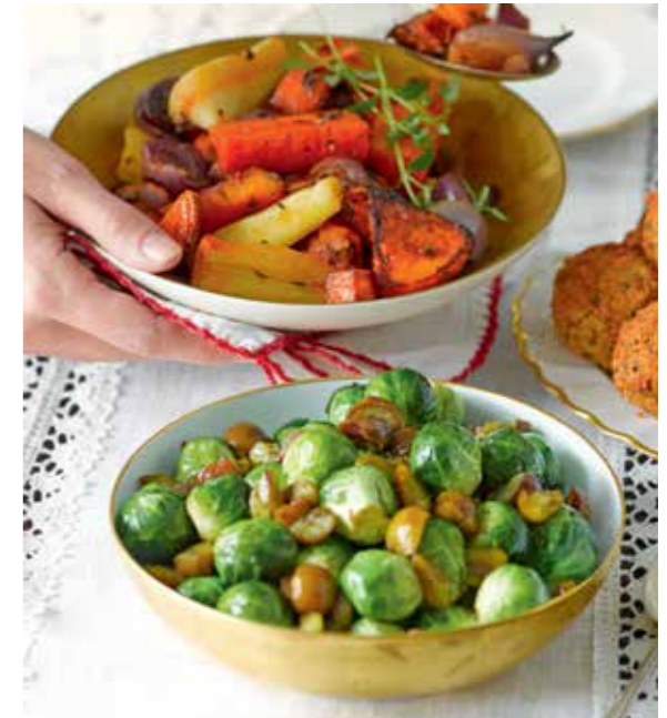
Winter Vegetables , with thyme and olive oil butter, £2 , 700g (28.6p/100g); Sprouts & Chestnuts , sprouts and chestnut chunks with thyme-infused butter, £2 , 380g (52.7p/100g) Both available from 8 December