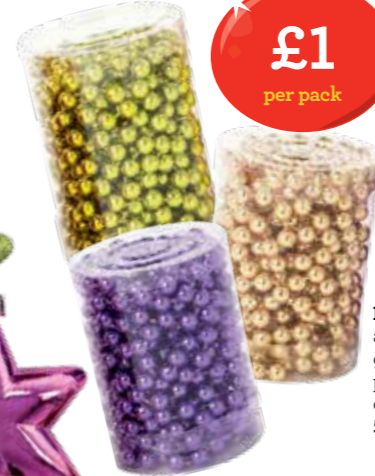
Beadchain, available in gold, lime, purple, red or silver, £1, 5 metres