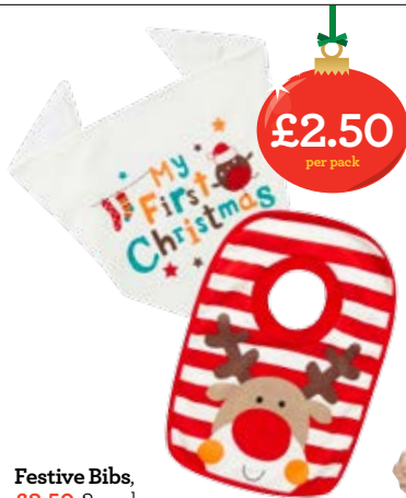
Festive Bibs, £2.50, 2 pack