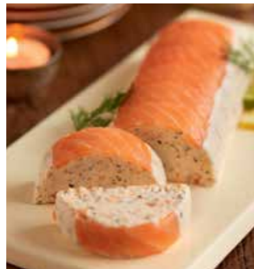
Honey Roast Smoked Salmon Terrine , smoked salmon and cream cheese mousse topped with tender smoked salmon, £4.99 , 275g (£1.82/100g) Available from 22 December