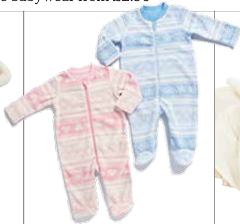
Product Name, lorem ipsum dolor, £XX