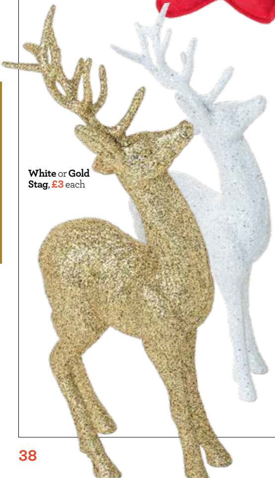
White or Gold Stag, £3 each