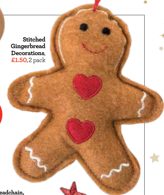
Stitched Gingerbread Decorations, £1.50, 2 pack