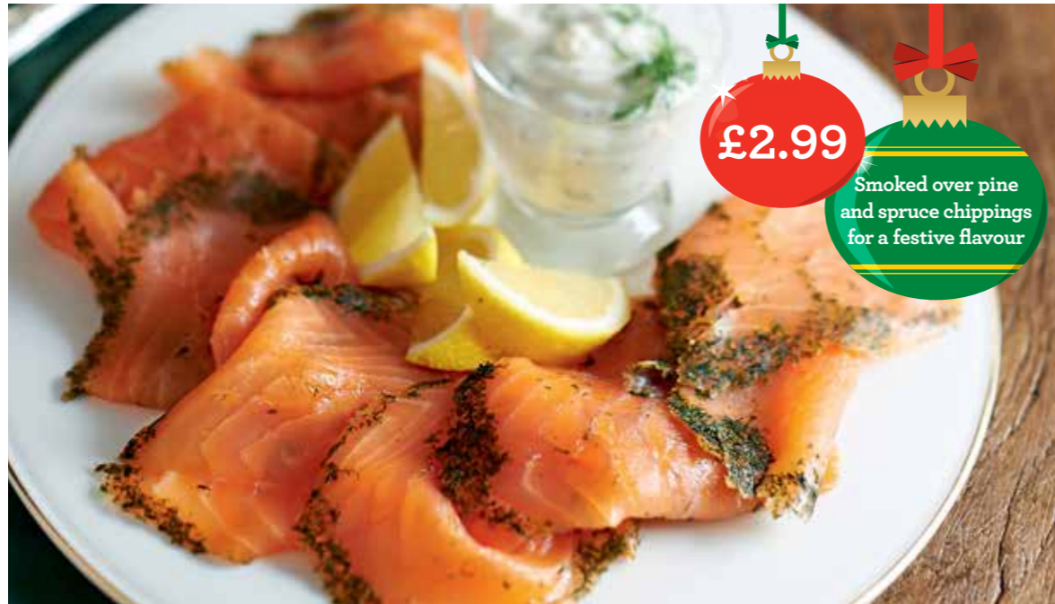
Christmas Tree Smoked Salmon , exclusive to Morrisons, £2.99 , 100g. Also available: M Signature Whisky Smoked Salmon , smoked over oak and cask chippings, then sprayed with Speyside malt whisky for a rich, sweet flavour, £4.99 , 120g (£4.16/100g) Both available from 26 November

Kick off your Christmas festivities in style with our delicious seafood and pâté delicacies