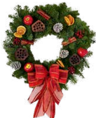
Luxury Christmas Wreath, £15 Available from 17 November