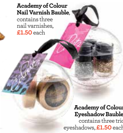
Academy of Colour Nail Varnish Bauble , contains three nail varnishes, £1.50 each