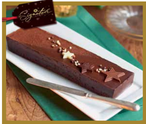
M Signature Belgian Chocolate Truffle Torte , rich, gooey chocolate fondant on a crunchy chocolate biscuit base, finished with a chocolate glaze, chunky chocolate stars and sparkling gold sugar, £5.99 , 640g (93.6p/100g) Available from 19 December