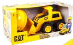
CAT Tough Truck With Helmet, £10 each