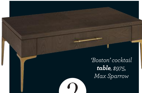
‘Boston’ cocktail table, $975, Max Sparrow

CHOOSE A STORAGE UNIT which encompasses a mixture of open shelving and cupboards and drawers. “The open shelving allows you to create personality by showing off favourite books, pieces from your travels and sculptural items that add visual interest,” says national visual lead Ebony Quaid of Pottery Barn. Meanwhile, the drawers and shelves will keep unsightly items – such as board games and children’s toys – well hidden.