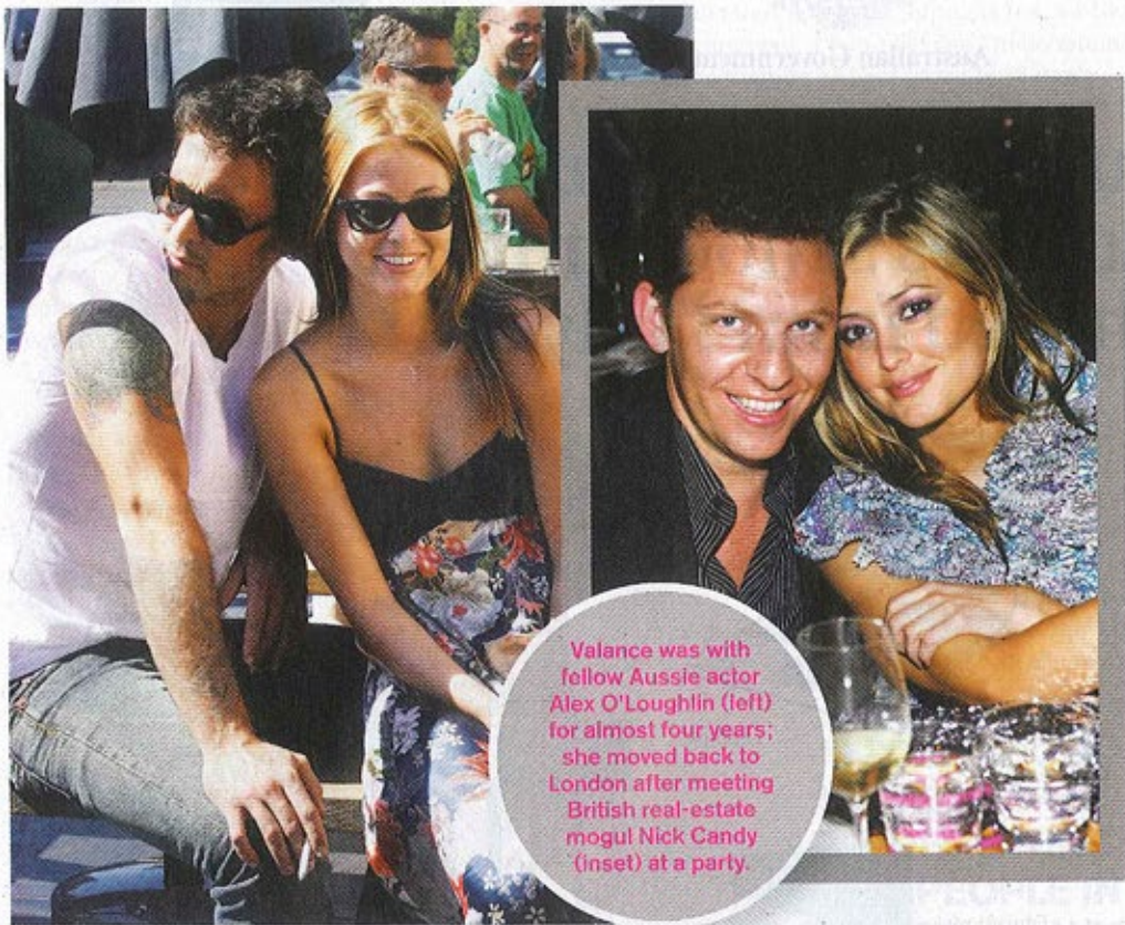
Valance was with fellow Aussie actor Alex O'Loughlin (left) for almost four years; she moved back to London after meeting British real-estate mogul Nick Candy (inset) at a party.

But second time around, it's a relaxed and chatty Valance on the line, who happily talks about her new life in London and her relationship with property developer Candy.