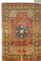
SILK KASHAN CARPET, IRAN, 1500s