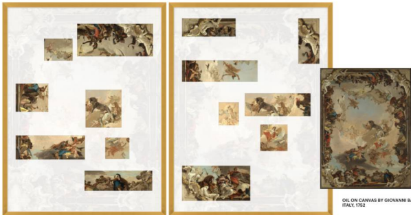
OIL ON CANVAS BY GIOVANNI BATTISTA TIEPOLO, ITALY, 1752