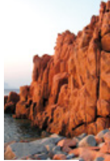
THE BEAUTIFUL RUSTIC DÉCOR ENSURES AN AUTHENTIC EXPERIENCE