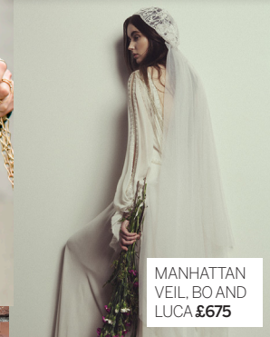
MANHATTAN VEIL, BO AND LUCA £675