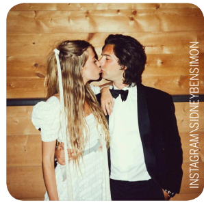
INSTAGRAM SIDNEY BEN SIMON