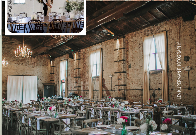
LEV KUPERMAN PHOTOGRAPHY