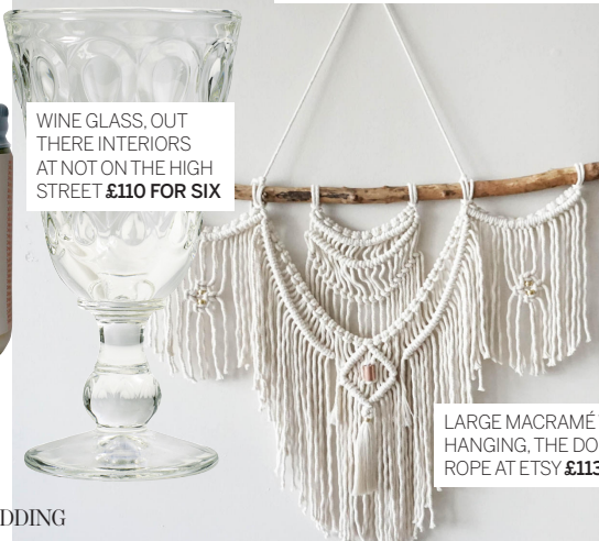
LARGE MACRAMÉ WALL HANGING, THE DOPE ROPE AT ETSY £113