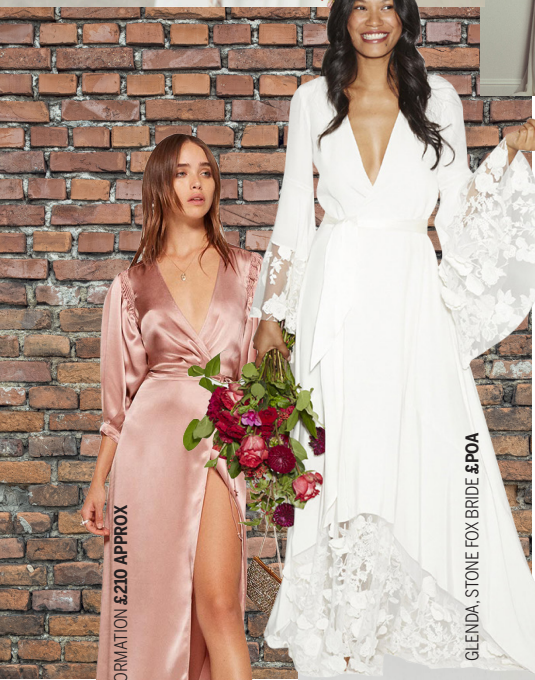
OLIVINE, REFORMATION £210 APPROX