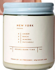
NEW YORK SCENTED CANDLE, TROUVA £25