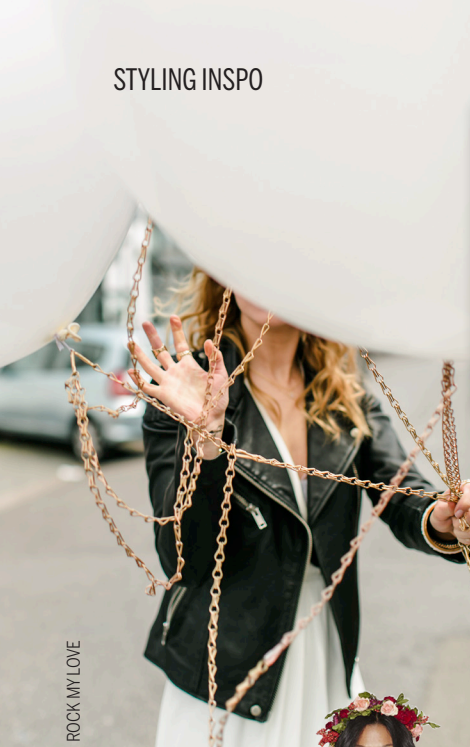
ROCK MY LOVE