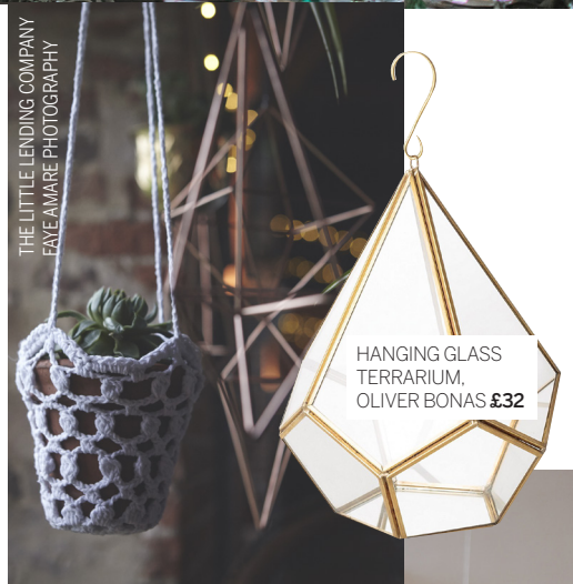
HANGING GLASS TERRARIUM, OLIVER BONAS £32