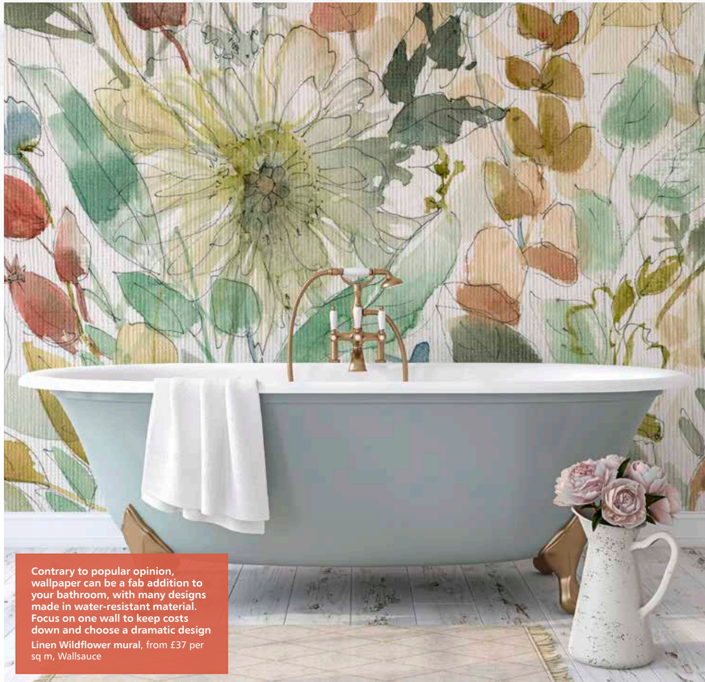
Contrary to popular opinion, wallpaper can be a fab addition to your bathroom, with many designs made in water-resistant material. Focus on one wall to keep costs down and choose a dramatic design Linen Wildflower mural, from £37 per sq m, Wallsauce

Save big with stylish updates that'll transform your space without draining your resources