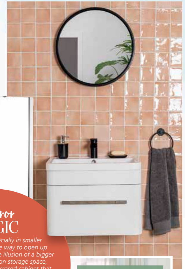
Milano Ren wall-hung bathroom mirrored cabinet in White, £129.99, Big Bathroom Shop

Manacor Blush Pink 100 x 100mm wall tiles, £34.99 per sq m, Tile Mountain