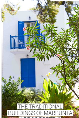
THE TRADITIONAL BUILDINGS OF MARPUNTA ARE SO PRETTY!