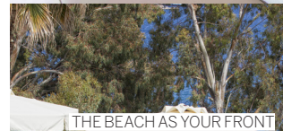
THE BEACH AS YOUR FRONT GARDEN = HEAVEN!