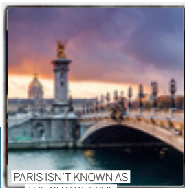
PARIS ISN'T KNOWN AS THE CITY OF LOVE FOR NOTHING!