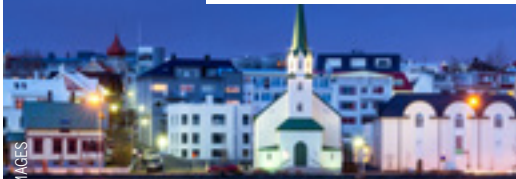
GET READY TO HAVE YOUR BREATH TAKEN AWAY (AND NOT JUST BY THE ICELAND TEMPERATURE!)

STAY AT: Hotel Holt ( holt.is ), one of the oldest hotels in the city with one of the biggest collections of art by artist Jóhannes Kjarval, who used to pay for his room with paintings. DON'T MISS: Drive 30 minutes out