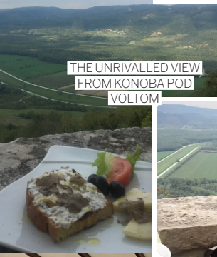
THE UNRIVALLED VIEW FROM KONOBA POD VOLTOM

PW's Colette discovers why Istria is the perfect place for a destination wedding