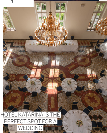
HOTEL KATARINA IS THE PERFECT SPOT FOR A WEDDING