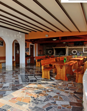
WE HAD THE BEST DESSERTS WE'VE EVER EXPERIENCED AT RESTAURANT BADI