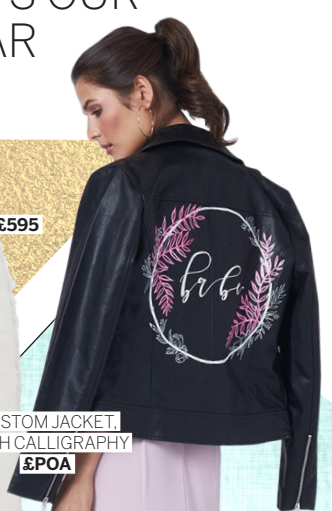
CUSTOM JACKET, BASH CALLIGRAPHY £POA