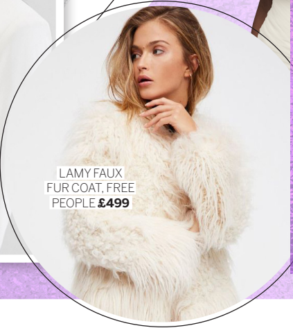
LAMY FAUX FUR COAT, FREE PEOPLE £499