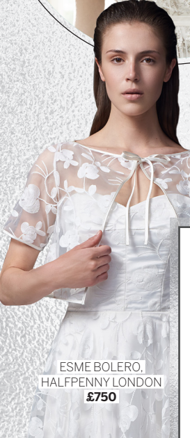
ESME BOLERO, HALFPENNY LONDON £750