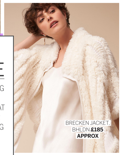
BRECKEN JACKET, BHLDN £185 APPROX