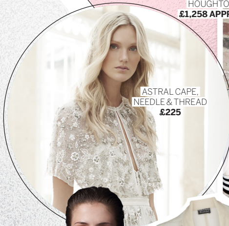
ASTRAL CAPE, NEEDLE & THREAD £225