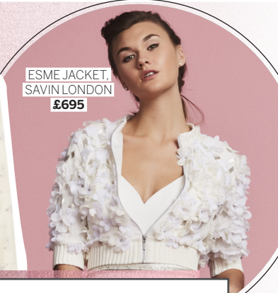
ESME JACKET, SAVIN LONDON £695