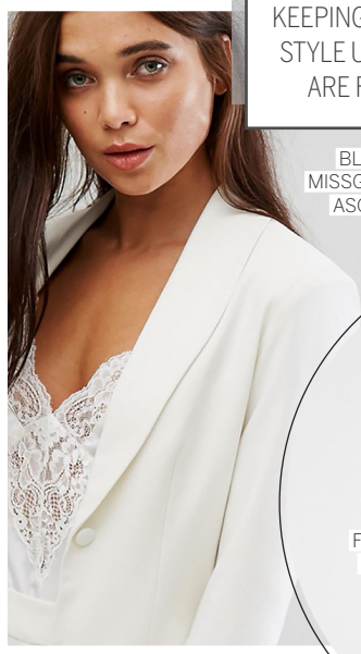
BLAZER, MISSGUIDED AT ASOS £35