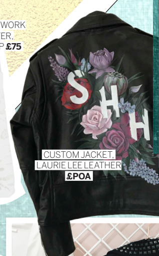
CUSTOM JACKET, LAURIE LEE LEATHER £POA

ONE OF OUR FAVE TRENDS OF THE MOMENT, CUSTOMISED DENIM, LEATHER AND PLEATHER JACKETS ARE ALL THE RAGE. GET YOURS PERSONALISED WITH YOUR W-DAY DATE, NAME, FAVE PHRASE... ANYTHING YOU LIKE!