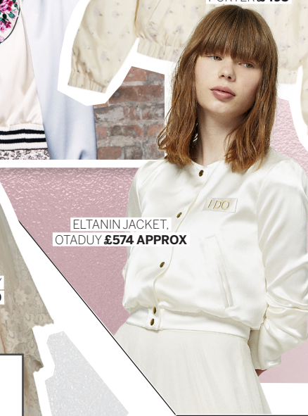
ELTANIN JACKET, OTADUY £574 APPROX