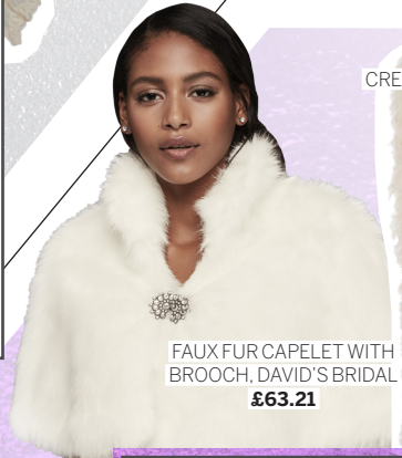
FAUX FUR CAPELET WITH BROOCH, DAVID'S BRIDAL £63.21