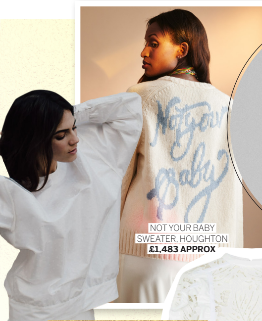
NOT YOUR BABY SWEATER, HOUGHTON £1,483 APPROX

FROM COOL JACKETS TO COSY KNITWEAR, HERE'S OUR ROUND UP OF THE BEST BRIDAL OUTERWEAR