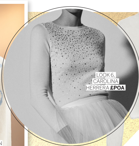
LOOK 6, CAROLINA HERRERA £POA