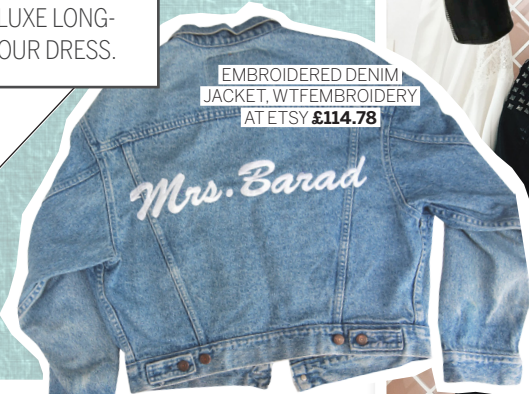
EMBROIDERED DENIM JACKET, WTFEMBROIDERY AT ETSY £114.78