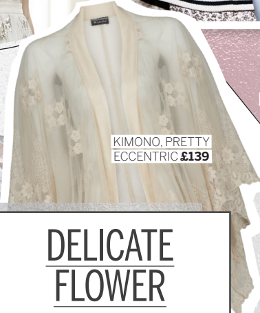
KIMONO, PRETTY ECCENTRIC £139