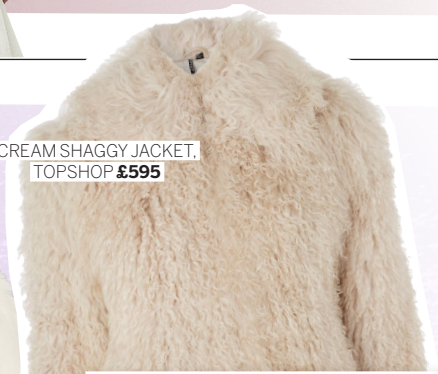
CREAM SHAGGY JACKET, TOPSHOP £595

PRETTY DRESSES DESERVE PRETTY JACKETS. THINK DAINY BOLEROS, FLOWING KIMONOS AND LIGHT, CHIC BLAZERS. NOT SO MUCH FOR KEEPING WARM, BUT MORE TO STYLE UP YOUR LOOK, THESE ARE FOR FASHIONISTAS.