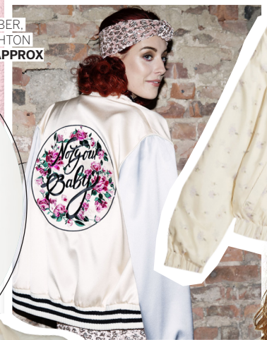
BOMBER, HOUGHTON £1,258 APPROX