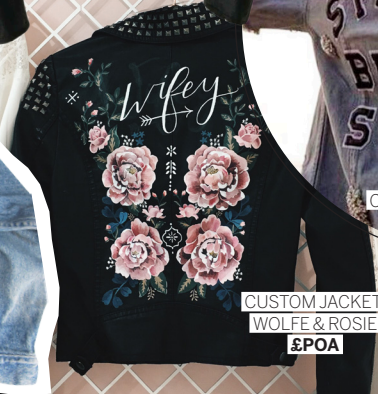
CUSTOM JACKET, WOLFE & ROSIE £POA