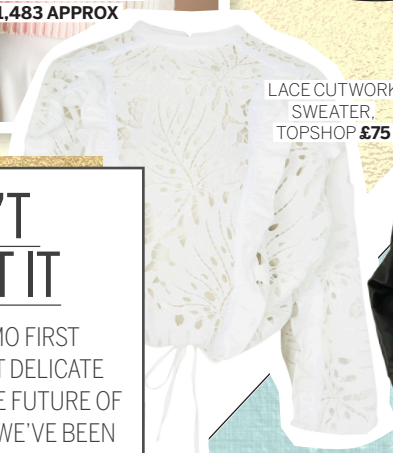
LACE CUTWORK SWEATER, TOPSHOP £75