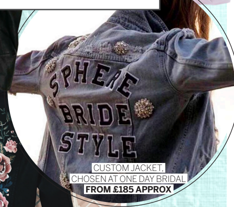
CUSTOM JACKET, CHOSEN AT ONE DAY BRIDAL FROM £185 APPROX