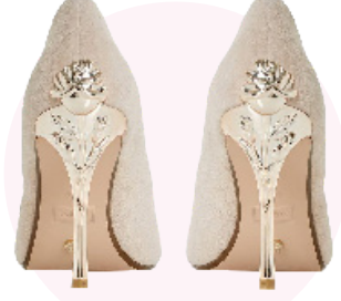
BUDS SHOE, DUNE £95