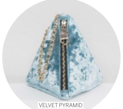
VELVET PYRAMID CLUTCH, ASOS £15