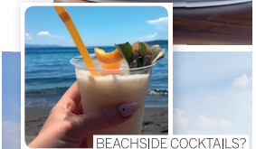
BEACHSIDE COCKTAILS? YES PLEASE!