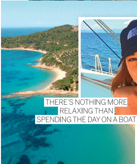
THERE'S NOTHING MORE RELAXING THAN SPENDING THE DAY ON A BOAT