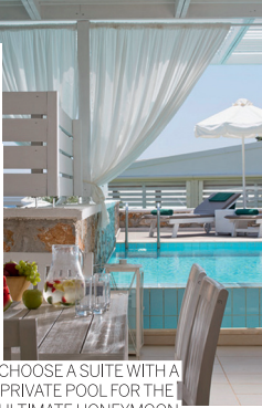
CHOOSE A SUITE WITH A PRIVATE POOL FOR THE ULTIMATE HONEYMOON