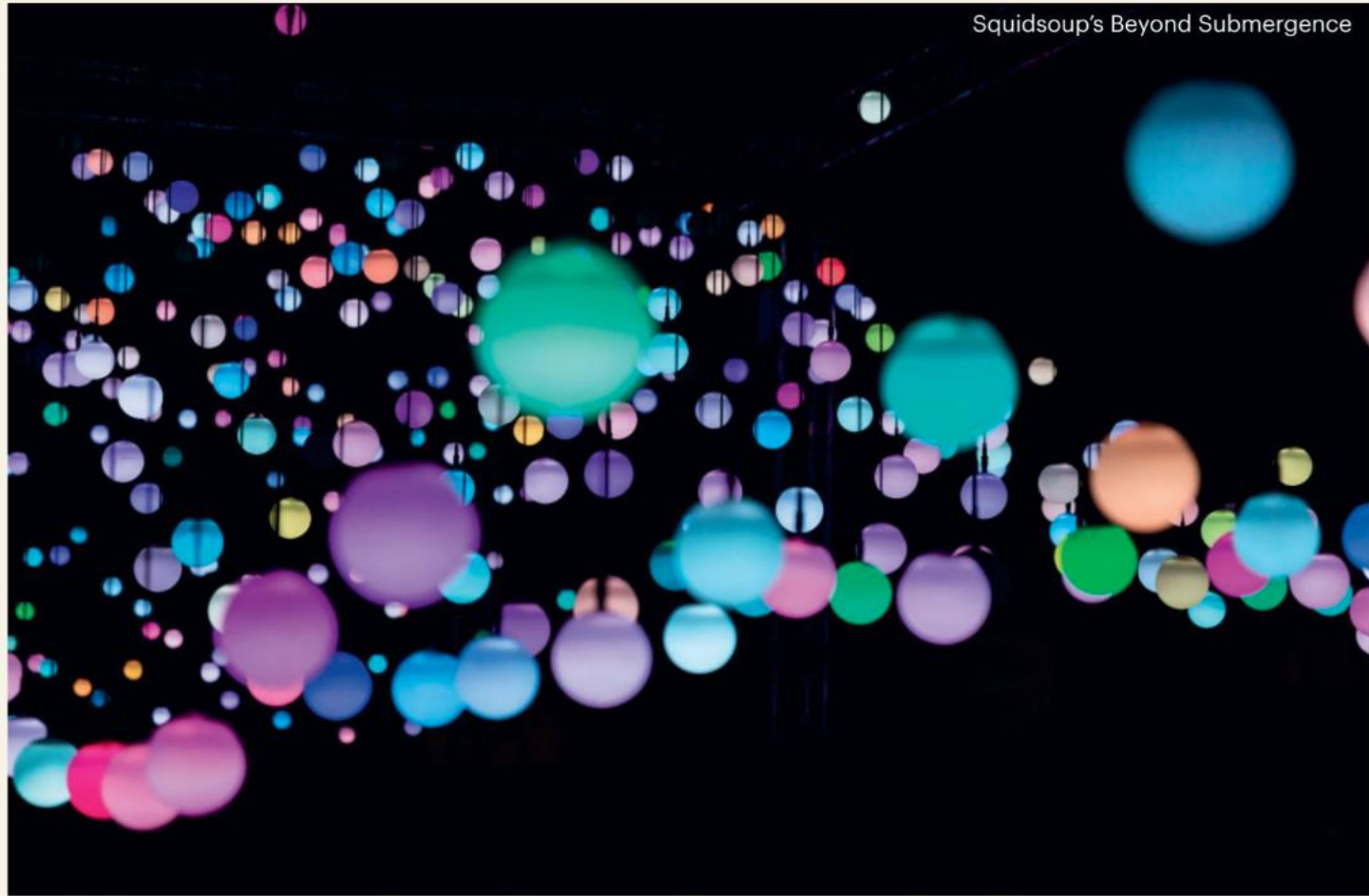
Squidsoup's Beyond Submergence