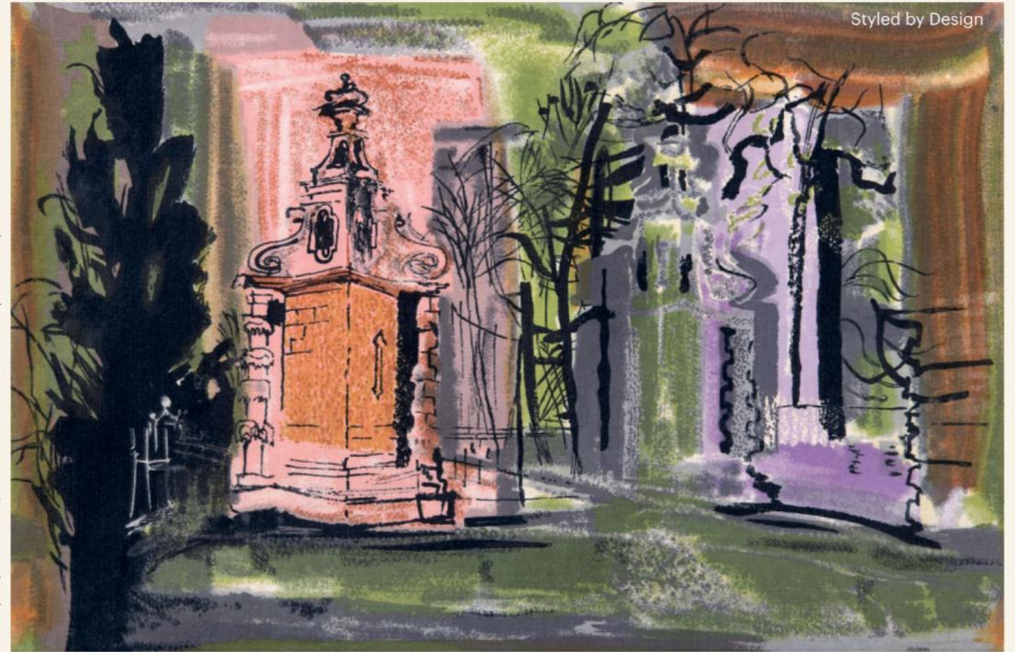
Styled by Design