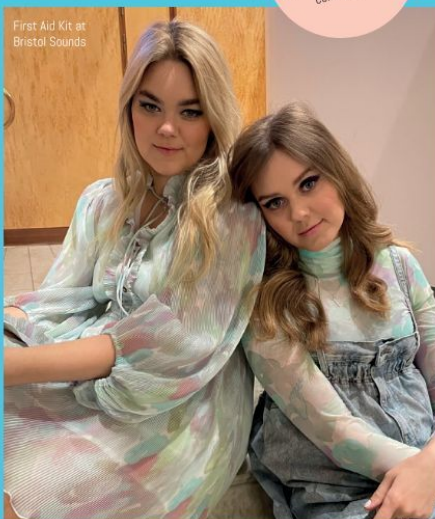
First Aid Kit at Bristol Sounds

DISCOVER MORE GREAT EVENTS ON OUR WEBSITE AT circusjournal.com/whats-on