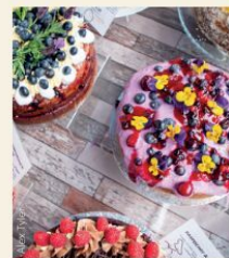
Cirencester Vegan Market

Is there any better way to celebrate Her Majesty's Jubilee than with a good old-fashioned street party? Prepare for a totally British celebration (tea, scones, bunting, polite queuing – the lot) with tasty food roasted over the Roth Bar & Grill fires. Plus, vintage cars, live music and dancing. rothbarandgrill.co.uk