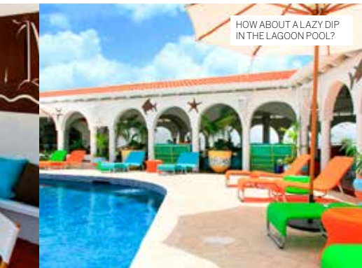
HOW ABOUT A LAZY DIP IN THE LAGOON POOL?