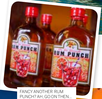
FANCY ANOTHER RUM PUNCH? AH, GO ON THEN...