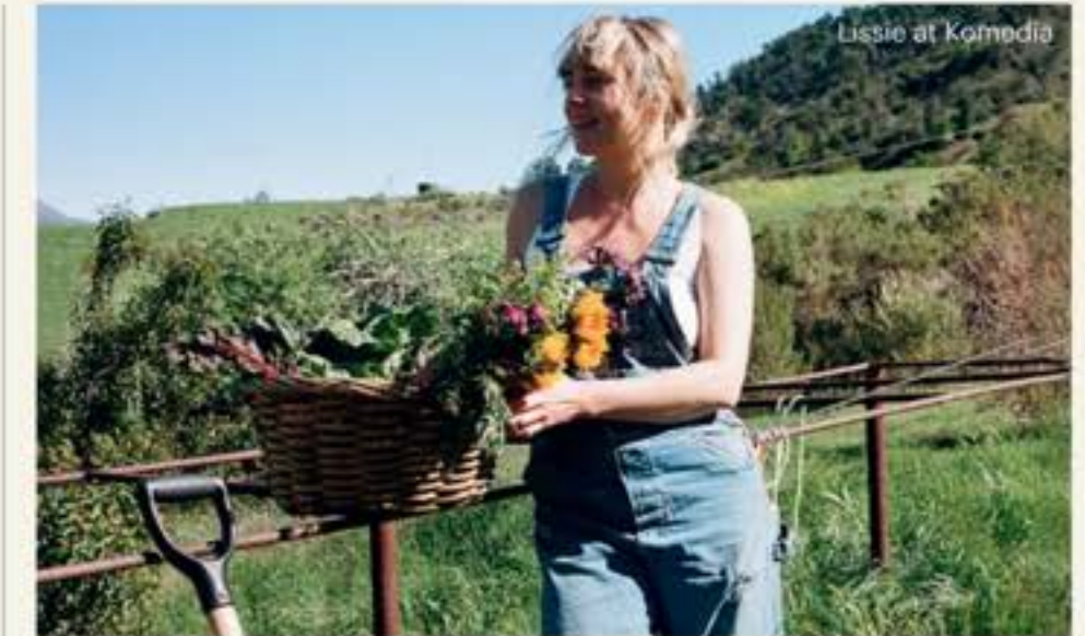
Lissie at Komedia