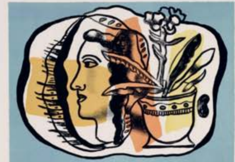
The Wilson Art Gallery and Museum