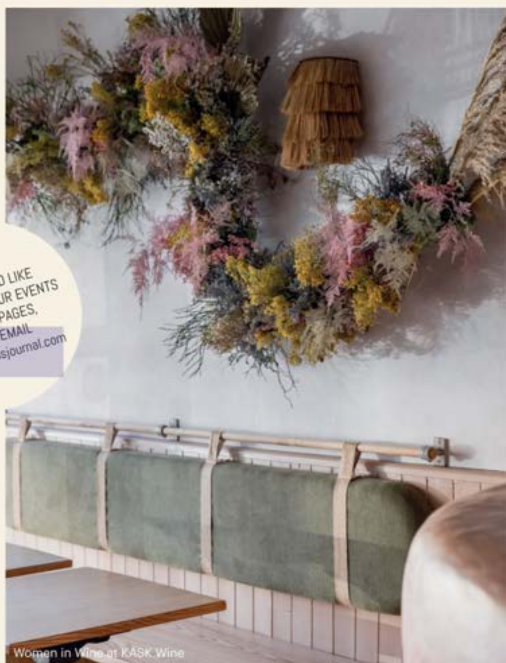
Women in Wine at KASK Wine

IF YOU WOULD LIKE TO PROMOTE YOUR EVENTS ON THESE PAGES, PLEASE EMAIL simon@circusjournal.com