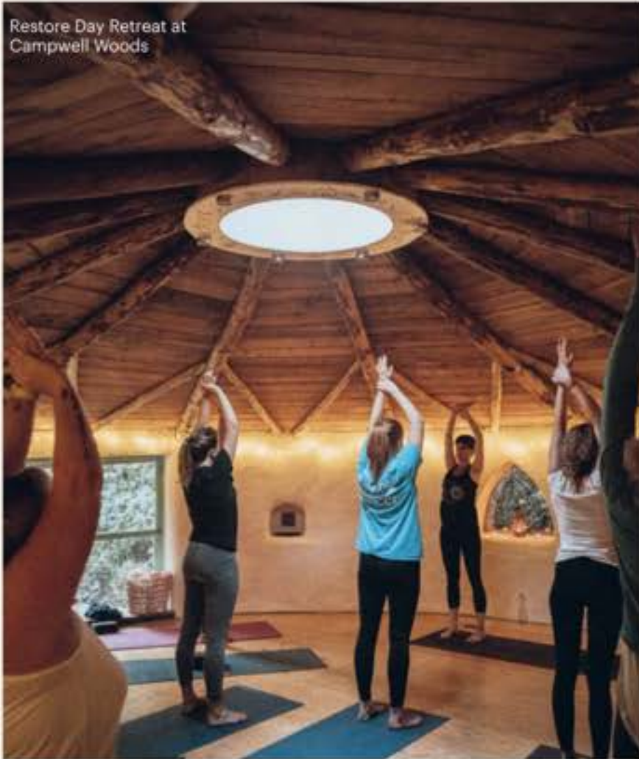
Restore Day Retreat at Campwell Woods