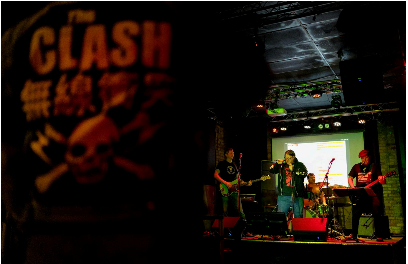
A patron performs with Karaoke Crime Scene at the Red Sea Restaurant and Bar in Minneapolis.