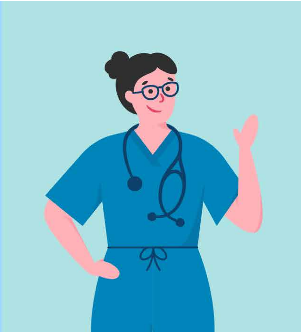
OPTION 1 (RECO)