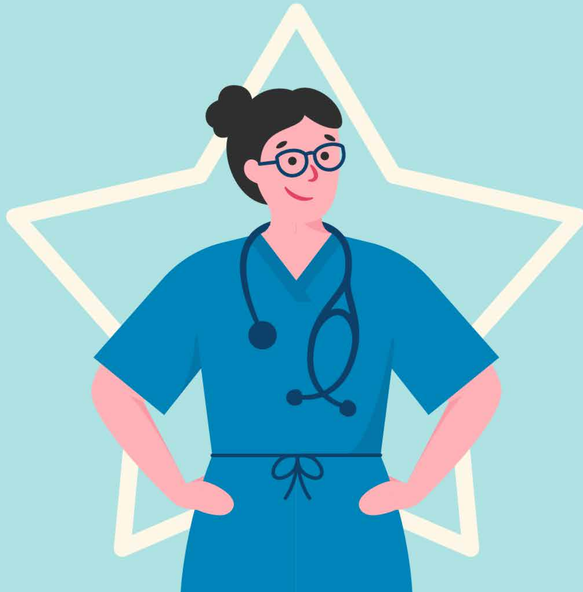
A large star appears in the background.