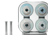
WELLNESS RACK WEIGHT KIT, TECHNOGYM He may or may not use it, but this striking white dumbbell set will surely impress any girl who walks in.

FOUR THINGS THAT SHOULD BE PRESENT IN EVERY SINGLE MAN'S HOME – TO BE USED AS DECORATIVE ITEMS, WORKOUT ITEMS OR CHICK MAGNETS!