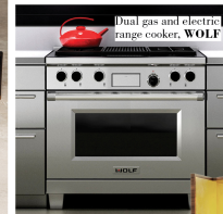
Dual gas and electric range cooker, WOLF