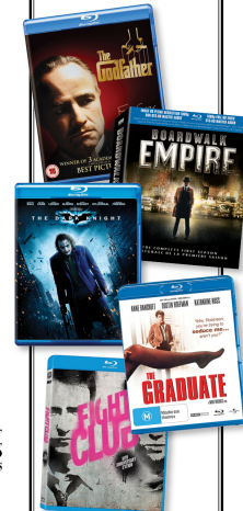
From top: The Godfather (1972) (or Al Pacino box set), Boardwalk Empire box set, The Dark Knight (2008), The Graduate (1967) and Fight Club (1999)

Expect to see some of these bachelors' favourites when you follow that corng pick-up line.