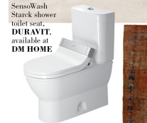
SensoWash Starck shower toilet seat, DURAVIT, available at DM HOME