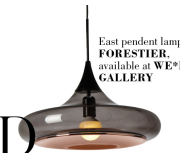
East pendant lamp, FORESTER, available at WE'DO GALLERY

Practically everyone works towards being able to afford and maintain a bachelor pad, even bachelorettes. This month we're all about the independent, suave and effortlessly stylish guy who doesn't live in a cramped studio apartment stacked with futons and udon noodles. They say your home reflects everything about you so why not make it everything ? From a place you'd be happy to spend Sunday morning to a place you'd be proud to host a guys' night in. We're not saying build a basketball court or a whisky bar in the middle of the living room (although wouldn't that be something) but why not make the most out of your space? We've rounded up bits of everything, from a bar by Giorgetti to a lounge chair that is both decorative and perfect for a lazy night in. Make it every man-child's dream with high-tech playthings – even a remote control toilet. Everyone knows a playboy's real playing field is his apartment, but these things might make overnight guests overstay their welcome. With a pad like this, we'd be willing to stay bachelors.