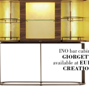
INO bar cabinet, GIORGETTI, available at EURO CREATIONS