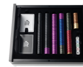
CARBON FIBRE POKER SET, ALFRED DUNHILL Strip poker! Magic trick! Endless possibilities to do with cards.