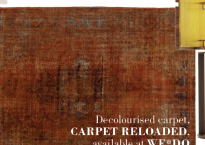
Decolourised carpet, CARPET RELOADED, available at WE'DO GALLERY