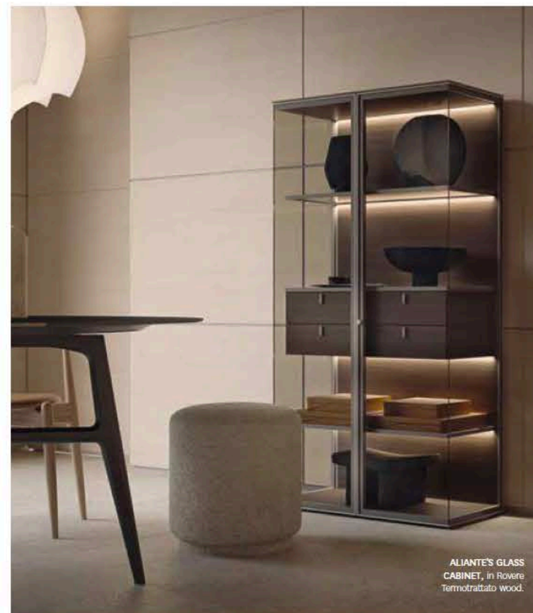
ALIANTE'S GLASS CABINET, in Rovere Termotratato wood.

the material in a three-dimensional yet soft relief, the finish offers a striking enhancement to 15 versatile products including sideboards, hinged doors, and the panels of the Modular wall system.