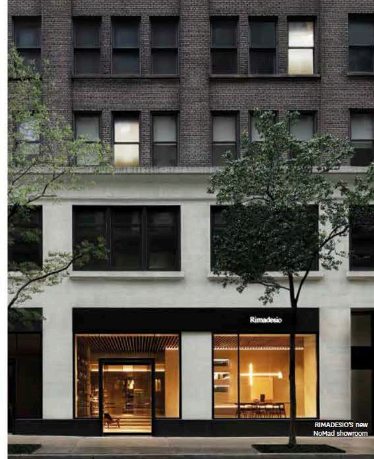
RIMADESIO'S new NoMad showroom

One of the brand's most sublime designs includes the Zenit system and bookcase—which just celebrated its 25th anniversary. A compositional triumph that examines the typology of the 'upright bookcase' through an exclusive coupling system that allows an open modularity of the elements and an aluminum upright sans holes or predefined connections. The bookcase version is now available with a brand new backlight upright and new suspended units, which like all Zenit elements, allow for free positioning. Meanwhile, Aliante, a moody glass cabinet also designed by Bavuso, was conceived as a precious glass box with gorgeous, suspended internal accessories—such as glass shelves and a wooden drawer unit—that appear to float and project an aesthetic lightness. The range of materials are just as jaw-droppingly beautiful. Two wood new finishes, rovere and tinto ebano, are now both available in the recently introduced and highly sought-after taiga finish. A tactile surface marked by thin horizontal stripes obtained through an innovative mechanical press process that renders