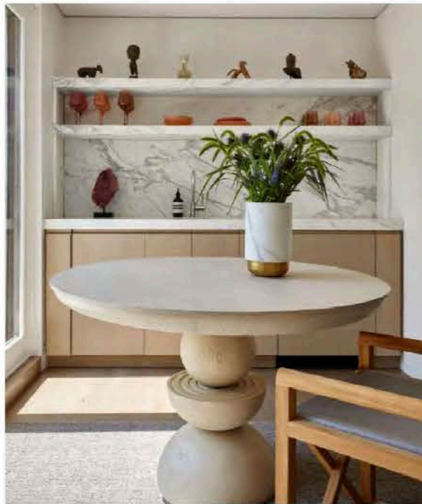
In the bar, beautifully veined marble from Artistic Tile is complemented by jewel-toned glasses and interesting objects. Dishwasher from Bosch ; Refrigerator/freezer drawers from Sub-Zero .