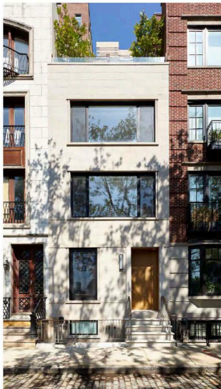
Opposite: The dining room echoes the clean simplicity of the overall design. Below: The designer added a fourth floor, integrating it into the townhome's existing limestone facade. To the left of the stairs, an entrance to the lower-level basement allows the family to take rescues and their own dogs directly into the dog spa.

Inside, the main level was reimagined as a loft-like space, unfolding from a bright and airy living room and expanding into a dining room, kitchen, and a newly added balcony that overlooks the gorgeous, modernized rear garden. "We wanted to open up the space and create a feeling of lightness to replace the typical series of closed-off rooms common to townhomes from this era," says Mercado. The living room—which is the epitome of understated luxury with its soft, neutral palette, exudes the feeling of a livable gallery. Mercado custom-designed a lightly veined marble fireplace that stretches from the floor to the 10-foot-high ceilings to create a dramatic architectural moment and anchor the space. On either side of the fireplace, a muted diptych by Kiki Lopez adds a sense of symmetry, their reflective nature enhancing the room's layered, tonal experience.