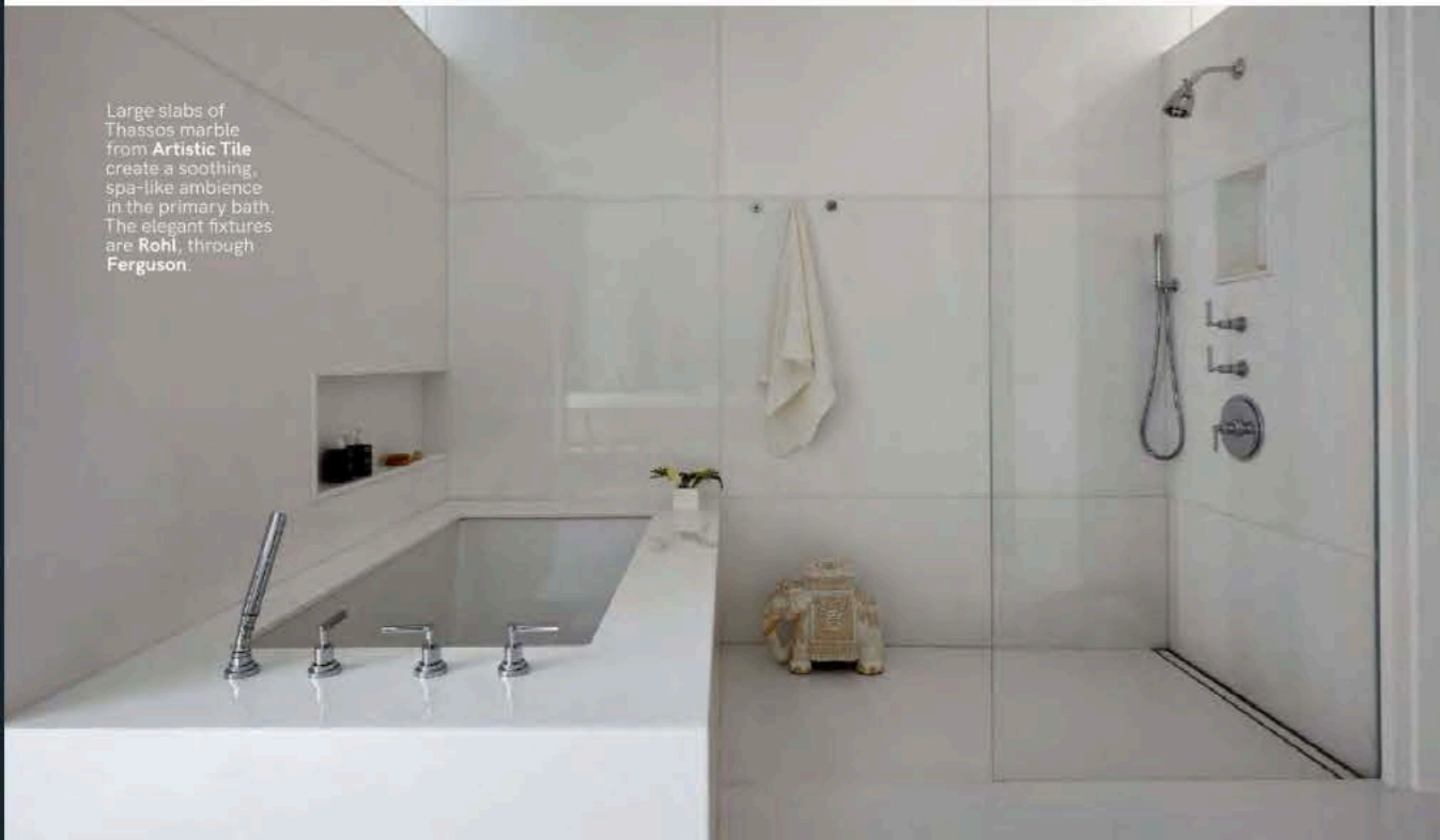
Large slabs of Thassos marble from Artistic Tile create a soothing, spa-like ambience in the primary bath. The elegant fixtures are Rohi , through Ferguson .