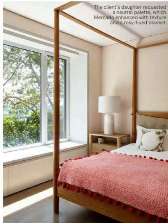
The client's daughter requested a neutral palette, which Mercado enhanced with texture and a rosy-hued blanket.