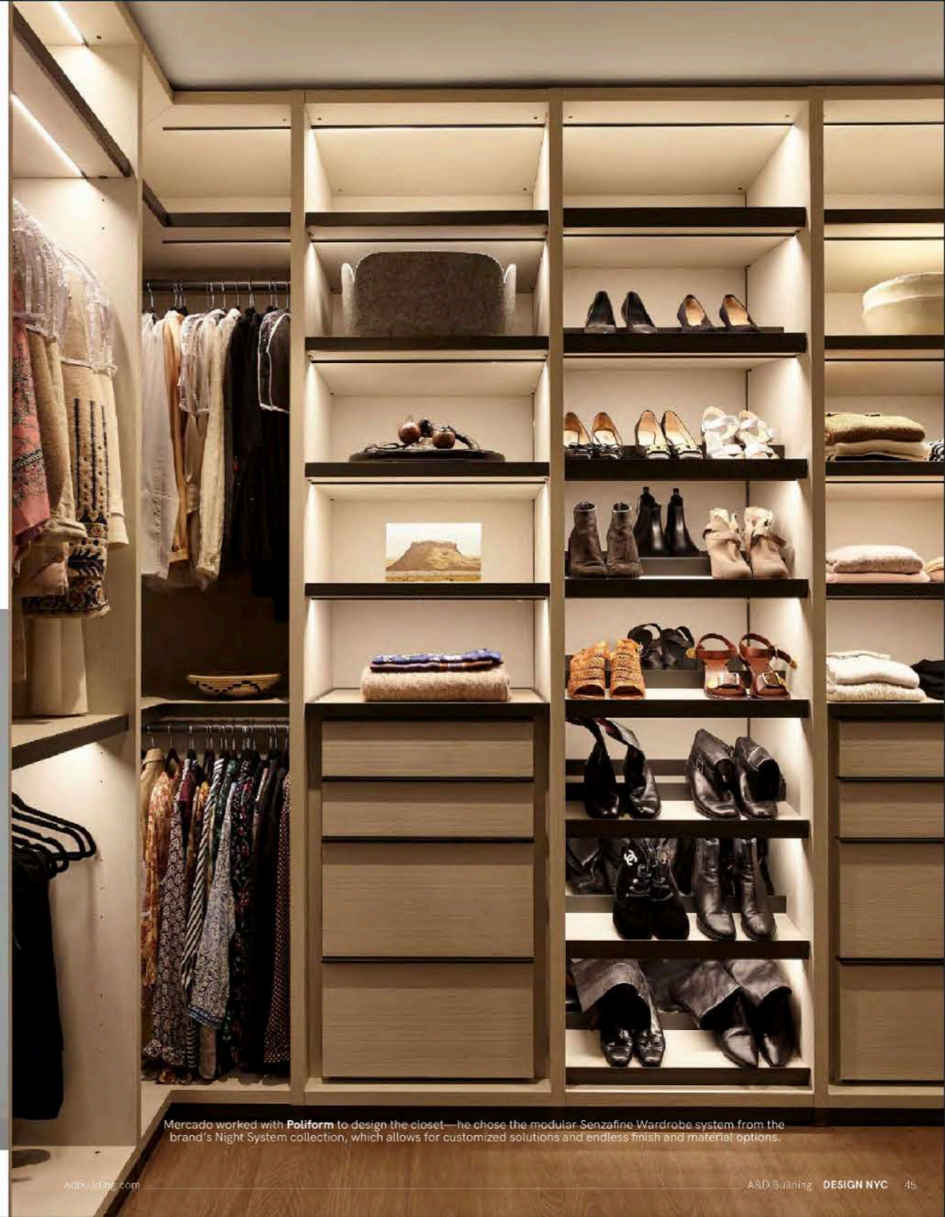
Mercado worked with Poliform to design the closet—he chose the modular Senzafine Wardrobe system from the brand's Night System collection, which allows for customized solutions and endless finish and material options.