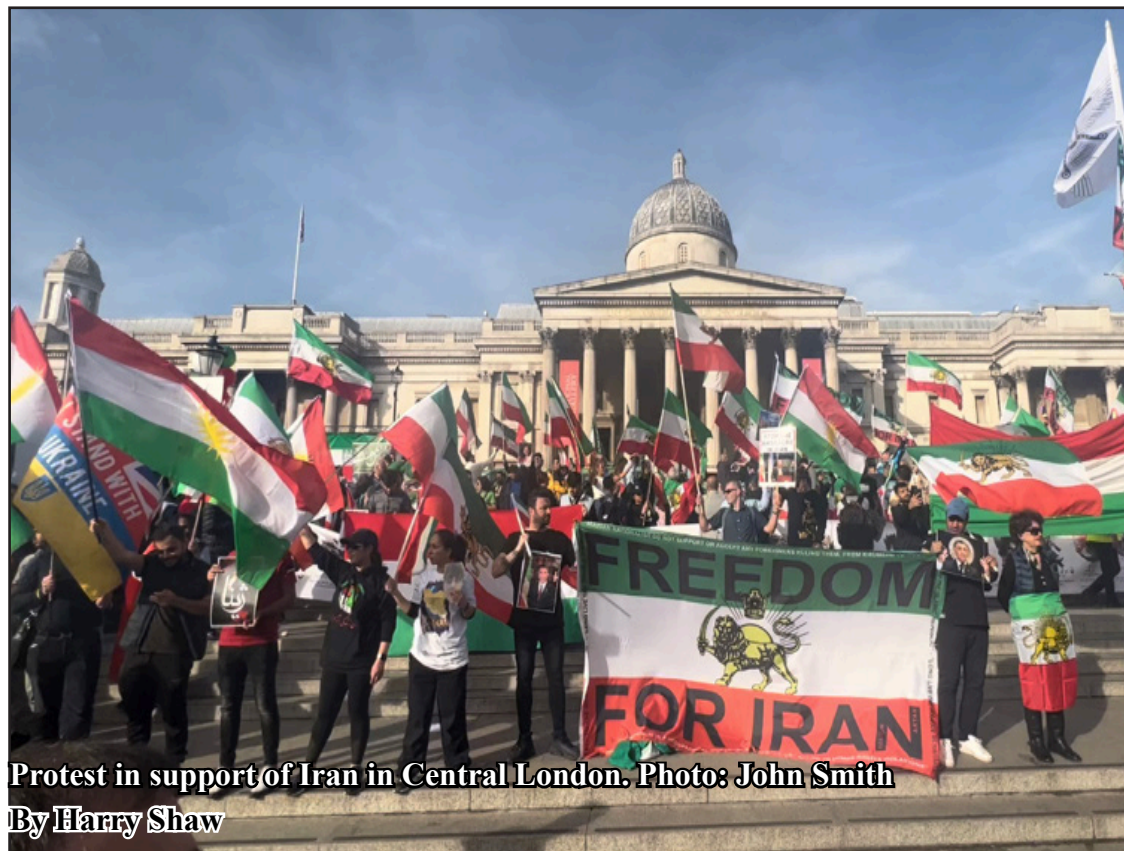
Protest in support of Iran in Central London.