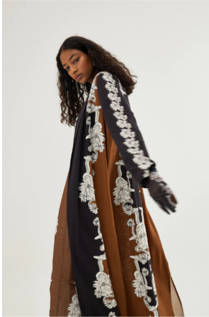
Look 5: Flowers and Spaceship - Brown:

https://1309studios.com/collections/abayas-2021/products/flowers-and-spaceship-brown