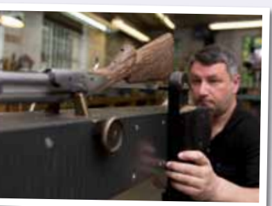
and finishes, so we can offer a bespoke gun suited to their sport.

customers seeking any one of its guns will arguably be as excited as the team making it when the two sides come together. Engraving talent from across Europe gives the new era at Rigby a truly international flavour, and that is without its renewed relationship with Mauser on new Rigby hunting rifles. The companies once developed one of the most successful magazine rifle designs in history, the Magnum Mauser action, so there are interesting times ahead. johnrigbyandco.com