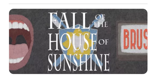
The Fall of the House of Sunshine Returns with Season 2 this March!