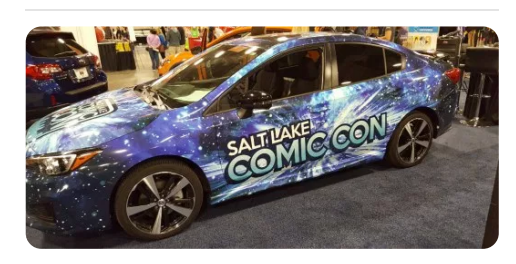
Salt Lake Comic Con 2017 Press Conference, Interviews, and Photo Gallery