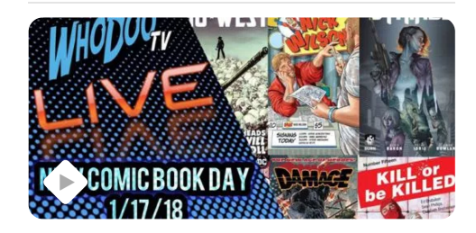
WhoDooTV Live! NCBD 1/17/18