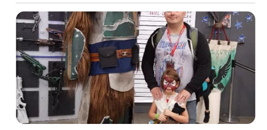
Salt Lake Comic Con Photo Gallery