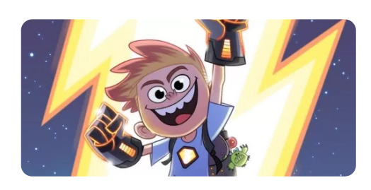
An interview with charity Little Heroes Anthology