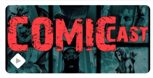
ComicCast Issue #74 "Avengers: No Surrender... Marvel's SECRET Event"