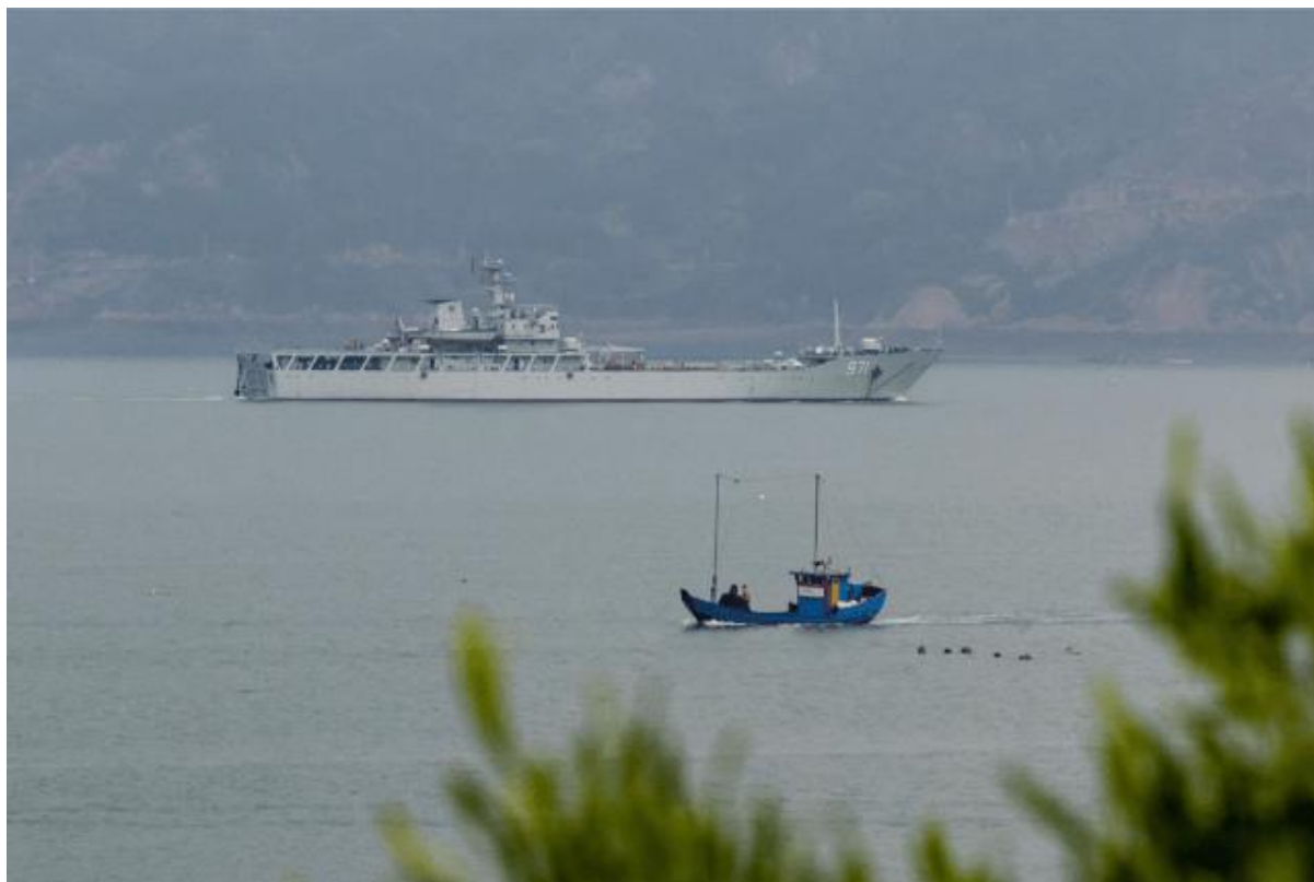
A Chinese war boat taking part in a military drill around the Taiwan-controlled Matsu Island

Divided views amongst Taiwanese over China's invasion as tensions between the cross-strait continue to rise.