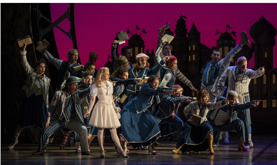
A scene from the current company of the national tour of Broadway's "Wicked," playing through March at Miami's Arsht Center for the Performing Arts.