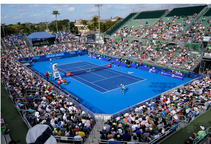
The scene during the 2022 Delray Beach Open. Just look at the size of that tennis court!