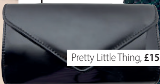
Pretty Little Thing, £15