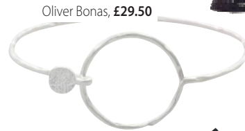
Oliver Bonas, £29.50