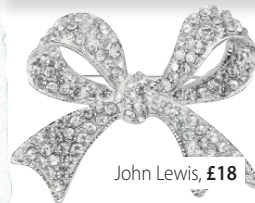
John Lewis, £18