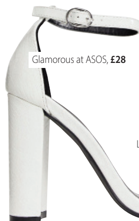
Glamorous at ASOS, £28