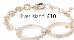
River Island, £10