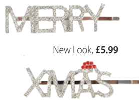
New Look, £5.99