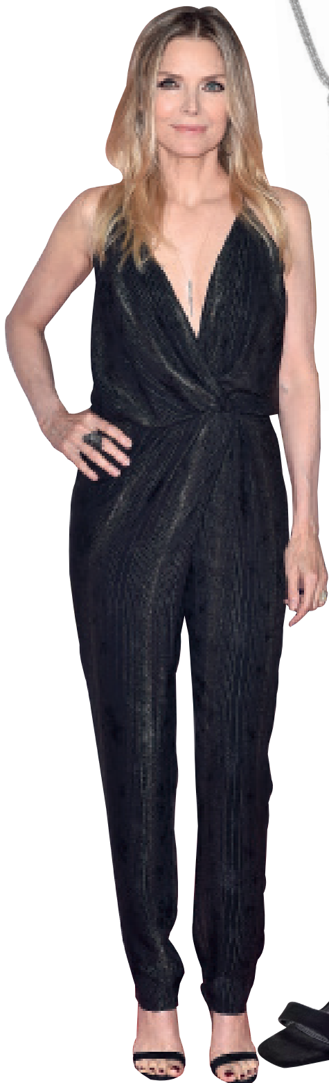
Mood at Debenhams, £20