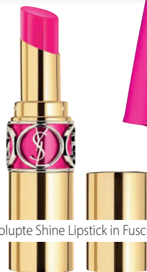
Rouge Volupte Shine Lipstick in Fuschia Stiletto, YSL, £29

Nicole loves bold colour and here she looks amazing in head-to-toe fuchsia. The very similar jumpsuit and blazer from River Island are must-haves because they'll work just as well in the summer months as they do over the festive season.