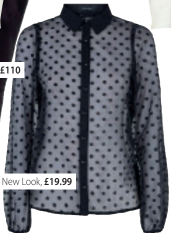
New Look, £19.99