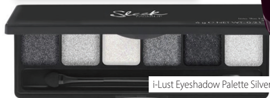
i-Lust Eyeshadow Palette Silver, Sleek, £7.99