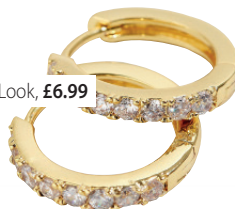
New Look, £6.99