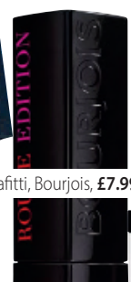
Lipstick in Fuschia Grafitti, Bourjois, £7.99