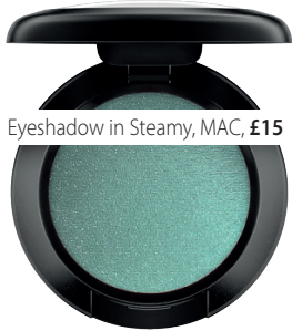
Eyeshadow in Steamy, MAC, £15