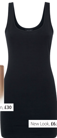
New Look, £6.99