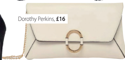
Dorothy Perkins, £16