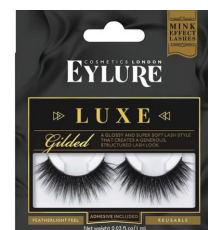
Luxe Faux Mink False Lashes, Eylure, £9.95