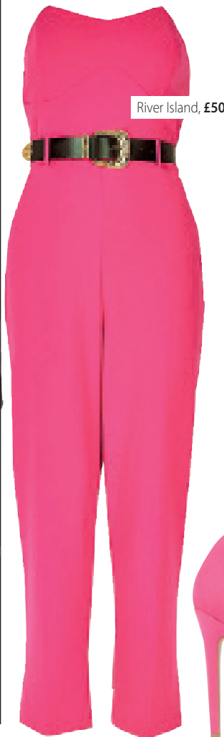
River Island, £50