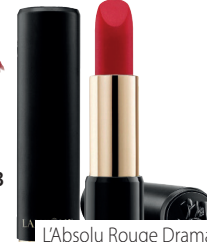
L'Absolu Rouge Drama Lipstick in Adoration, Lancôme, £21.60