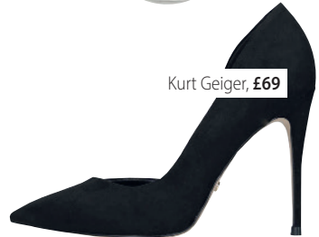
Kurt Geiger, £69