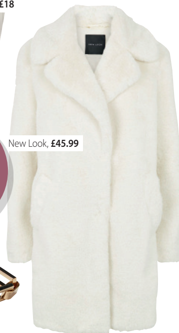
New Look, £45.99