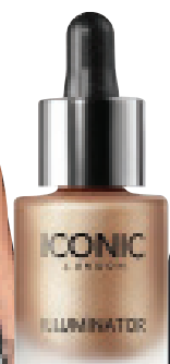
Illuminator, Iconic London, £30

Jennifer Lopez is a fan of wearing the same colour head-to-toe, and here she wows in black. The high shine loose trousers are on-trend when paired with a simple tank and sandals with a gold chain accent.