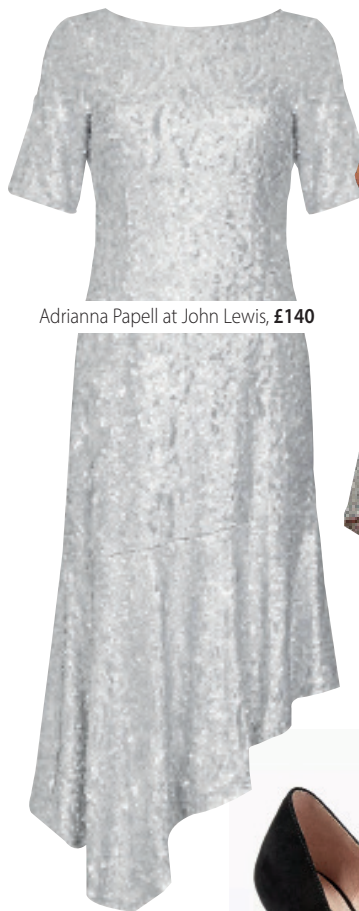
Adrianna Papell at John Lewis, £140