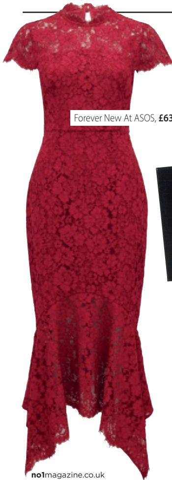
Forever New At ASOS, £63