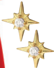
Oliver Bonas, £16