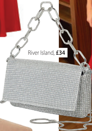
River Island, £34