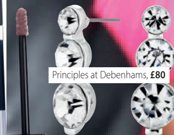
Principles at Debenhams, £80