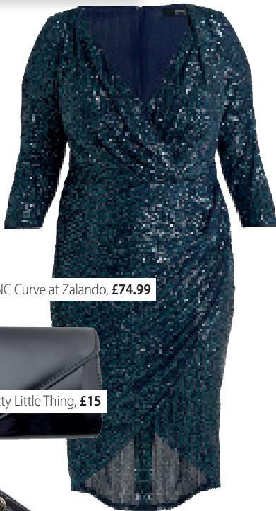
TFNC Curve at Zalando, £74.99

This sequin wrap-over dress on Rebel is so glam and we've found a similar one from TFNC. The gathered waist and fishtail detail, as well as the three-quarter length sleeve, makes it really flattering on curvy bodies – this is worth the investment!