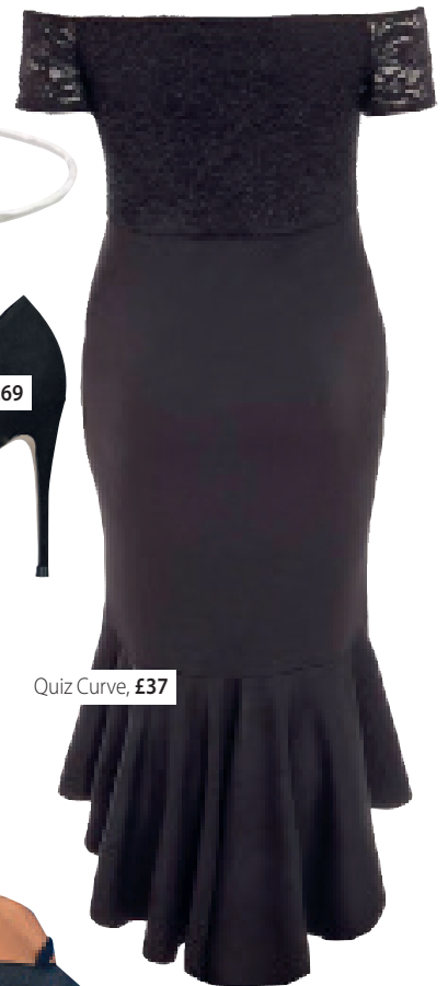
Quiz Curve, £37