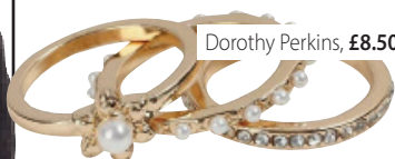
Dorothy Perkins, £8.50