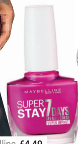
SuperStay Nail Polish in Fuchsia, Maybelline, £4.49