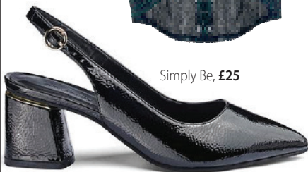
Simply Be, £25