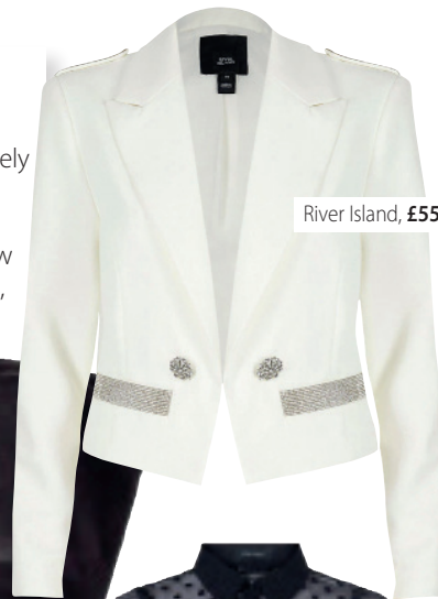
River Island, £55