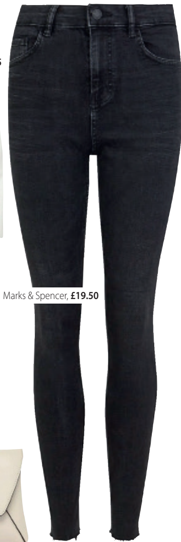
Marks & Spencer, £19.50