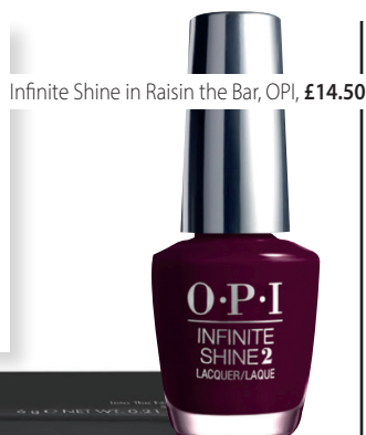
Infinite Shine in Raisin the Bar, OPI, £14.50

There's something about a black jumpsuit that manages to look chic but the exact opposite of try-hard. We love this frilled number from Quiz with the subtle sparkle running through the material, it's just like Michelle's.