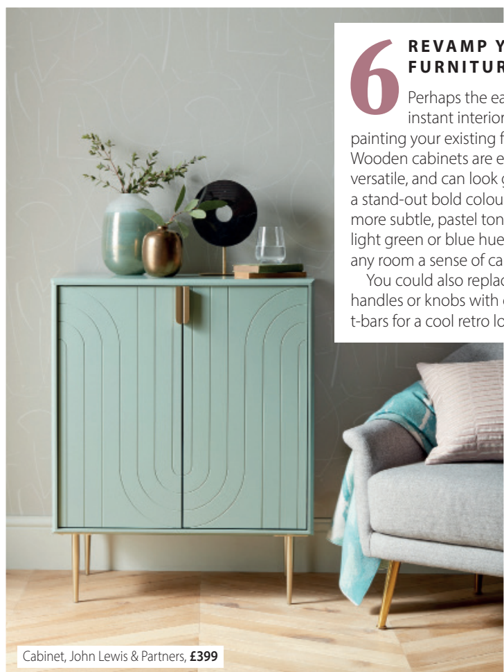
Cabinet, John Lewis & Partners, £399

You could also replace handles or knobs with gold t-bars for a cool retro look.