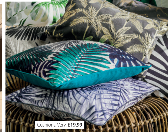
Cushions, Very, £19.99

The key is not to overdo the jungle vibe – look for small accessories like printed cushions. They go particularly well with wooden and wicker furniture and white walls.