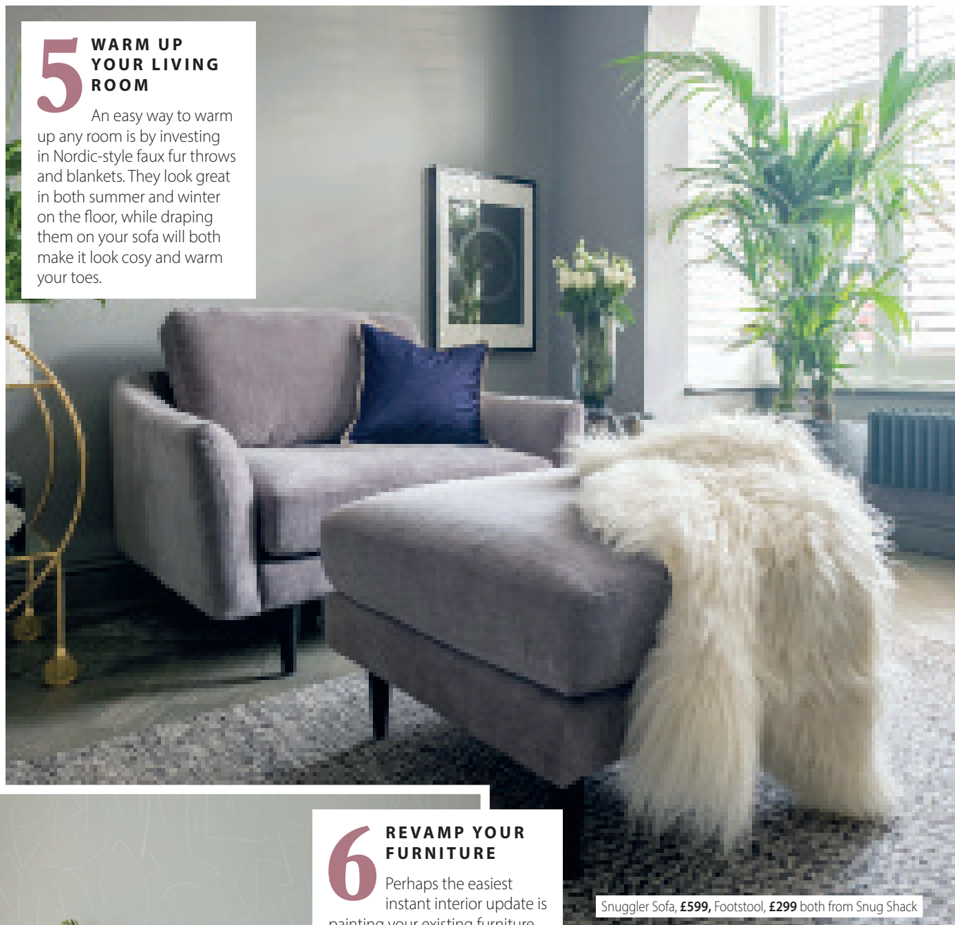
Snuggler Sofa, £599, Footstool, £299 both from Snug Shack

An easy way to warm up any room is by investing in Nordic-style faux fur throws and blankets. They look great in both summer and winter on the floor, while draping them on your sofa will both make it look cosy and warm your toes.