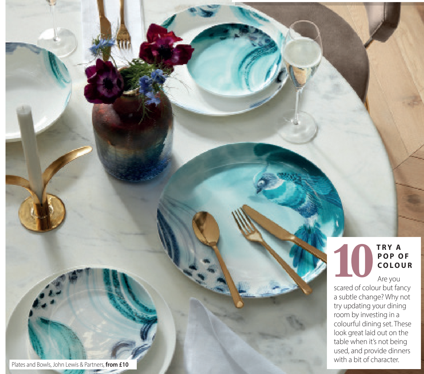
Plates and Bowls, John Lewis & Partners, from £10