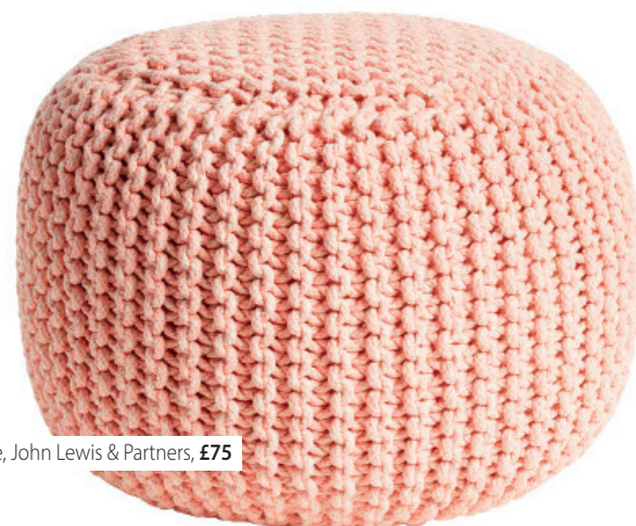
Pouffe, John Lewis & Partners, £75

Soft textures will make your interior look more interesting. A knitted pouffe is both perfect for resting tired legs while providing instant style points, while a textured cushion will add character to your sofa. Go for light, pastel colours – a garish pattern will throw off your room's theme.