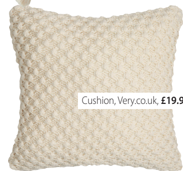
Cushion, Very.co.uk, £19.99