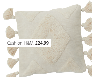
Cushion, H&M, £24.99