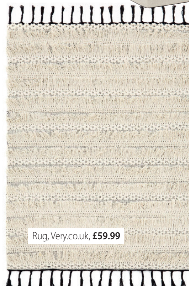
Rug, Very.co.uk, £59.99