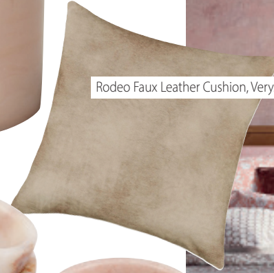
Rodeo Faux Leather Cushion, Very.co.uk, £16.99