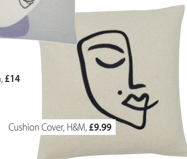
Cushion Cover, H&M, £9.99