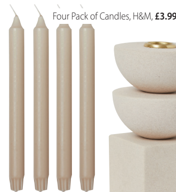
Four Pack of Candles, H&M, £3.99