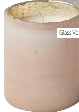
Glass Votive, Oliver Bonas, £19.50