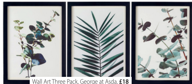
Wall Art Three Pack, George at Asda, £18