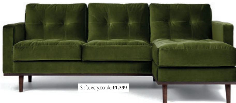
Sofa, Very.co.uk, £1,799