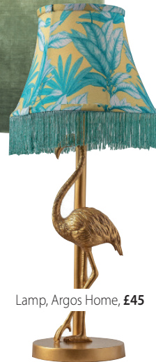
Lamp, Argos Home, £45