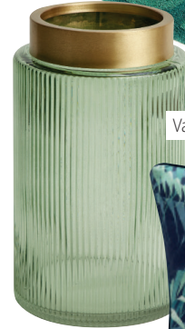
Vase, Dunelm, £20