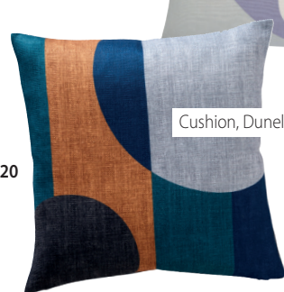
Cushion, Dunelm, £14