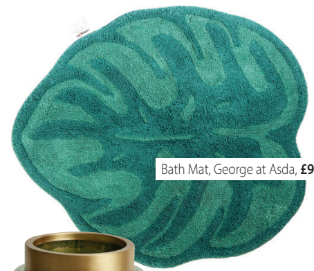
Bath Mat, George at Asda, £9