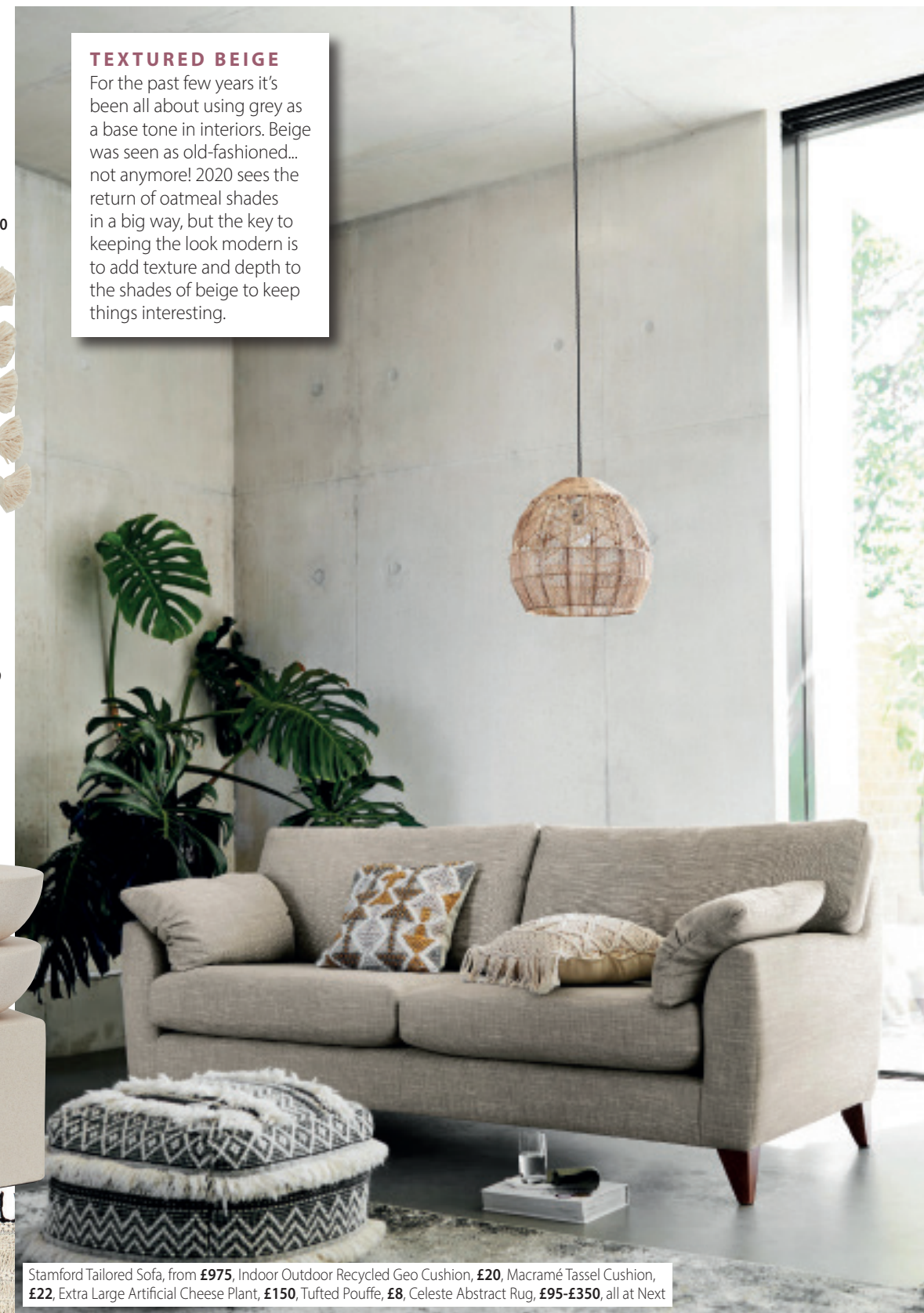
Stamford Tailored Sofa, from £975, Indoor Outdoor Recycled Geo Cushion, £20, Macramé Tassel Cushion, £22, Extra Large Artificial Cheese Plant, £150, Tufted Pouffe, £8, Celeste Abstract Rug, £95-£350, all at Next

For the past few years it's been all about using grey as a base tone in interiors. Beige was seen as old-fashioned... not anymore! 2020 sees the return of oatmeal shades in a big way, but the key to keeping the look modern is to add texture and depth to the shades of beige to keep things interesting.