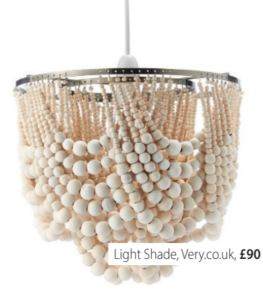
Light Shade, Very.co.uk, £90