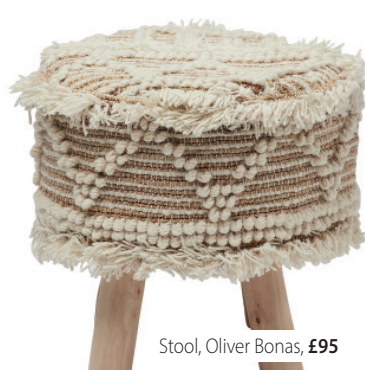
Stool, Oliver Bonas, £95