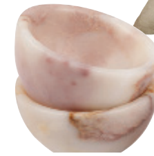
Bowl, Amara, £23 each