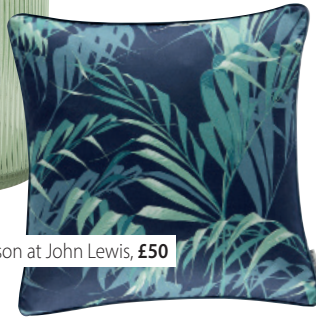
Cushion, Sanderson at John Lewis, £50