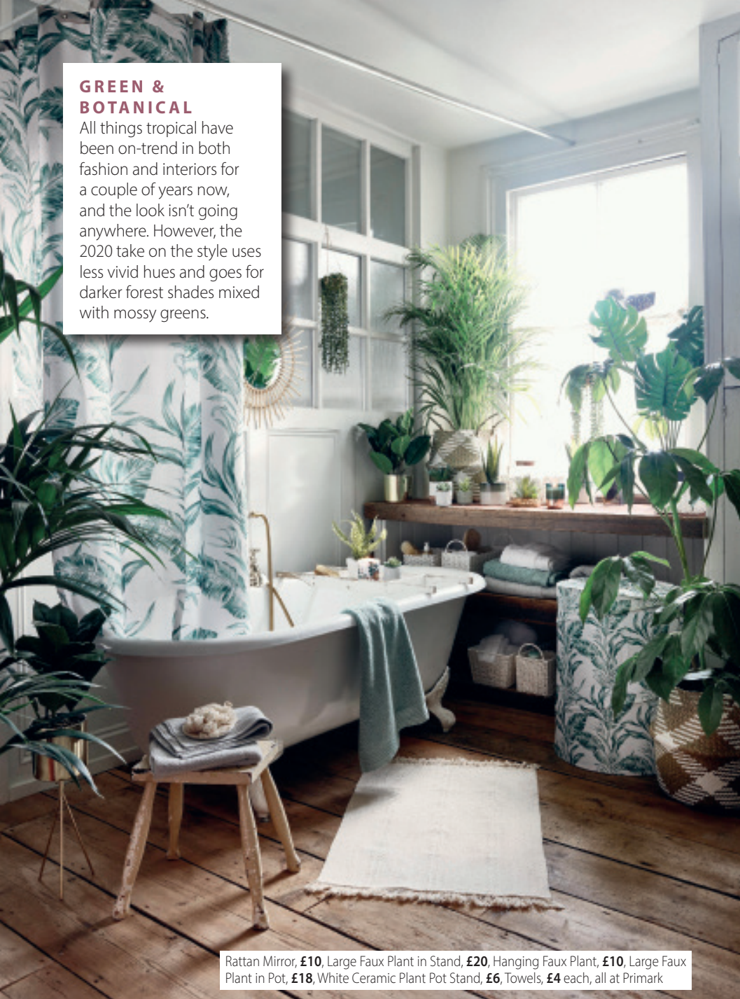
Rattan Mirror, £10, Large Faux Plant in Stand, £20, Hanging Faux Plant, £10, Large Faux Plant in Pot, £18, White Ceramic Plant Pot Stand, £6, Towels, £4 each, all at Primark

All things tropical have been on-trend in both fashion and interiors for a couple of years now, and the look isn't going anywhere. However, the 2020 take on the style uses less vivid hues and goes for darker forest shades mixed with mossy greens.