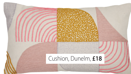
Cushion, Dunelm, £18