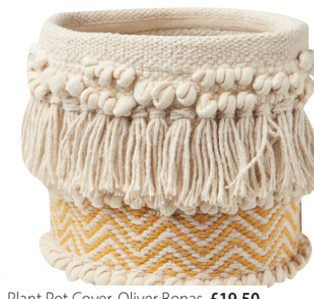
Plant Pot Cover, Oliver Bonas, £19.50