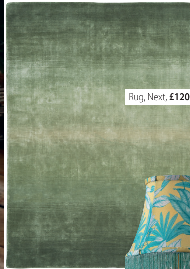
Rug, Next, £120-£280