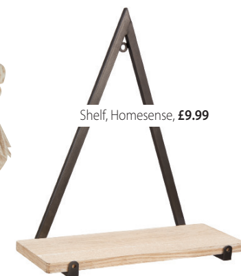
Shelf, Homesense, £9.99