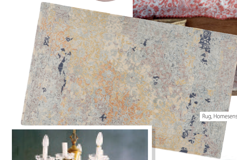
Rug, Homesense, £89.99