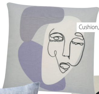
Cushion, M&Co., £12.99