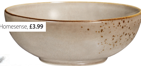
Bowl, Homesense, £3.99