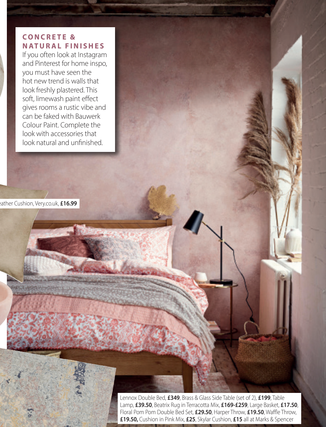
Lennox Double Bed, £349, Brass & Glass Side Table (set of 2), £199, Table Lamp, £39.50, Beatrix Rug in Terracotta Mix, £169-£259, Large Basket, £17.50, Floral Pom Pom Double Bed Set, £29.50, Harper Throw, £19.50, Waffle Throw, £19.50, Cushion in Pink Mix, £25, Skylar Cushion, £15 all at Marks & Spencer

If you often look at Instagram and Pinterest for home inspo, you must have seen the hot new trend is walls that look freshly plastered. This soft, limewash paint effect gives rooms a rustic vibe and can be faked with Bauwerk Colour Paint. Complete the look with accessories that look natural and unfinished.