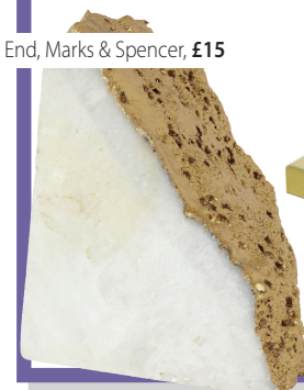
Book End, Marks & Spencer, £15