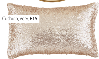
Cushion, Very, £15