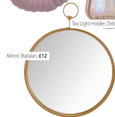
Mirror, Matalan, £12