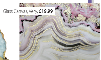
Glass Canvas, Very, £19.99