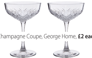
Champagne Coupe, George Home, £2 each