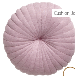
Cushion, John Lewis, £10

With French boudoir inspirations, there is a suggestion of old school glamour to this look. Cut glass perfume bottles, scalloped edges and gilded mirrors are all perfect for adding a touch of romanticism to your space. If you prefer your palette a little more muted, try incorporating soft dove greys into the look.