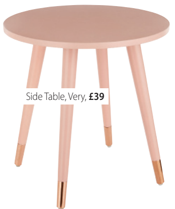
Side Table, Very, £39