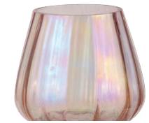
Tea Light Holder, Debenhams, £15