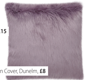
Cushion Cover, Dunelm, £8