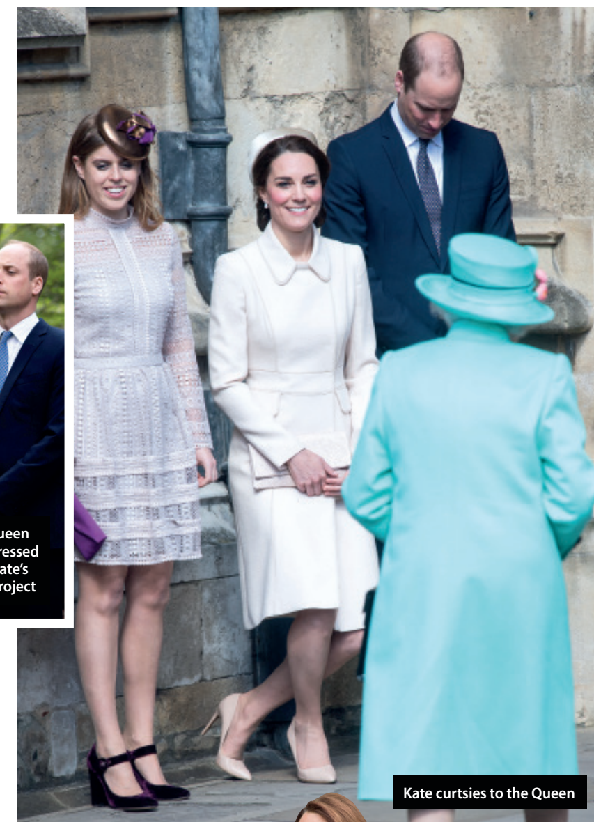
Kate curtsies to the Queen

Perhaps, if rumours are anything to go by, a little healthy competition between the Sussexes and the Cambridges has helped spur them on.