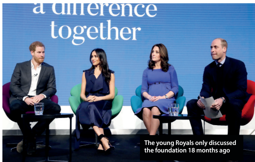
The young Royals only discussed the foundation 18 months ago

Over the years, Prince George and Princess Charlotte have been pictured at weddings and Royal events, but the only peek into their normal lives has been through the odd picture released by the couple, such as the children on their first day of nursery and school. But since the birth of Prince Louis, we've been given a little more insight into the personalities of the kids, with actual video footage of the children playing and chatting in Kate's Chelsea Flower Show Garden. Slowly but surely, the pair are letting the public in.