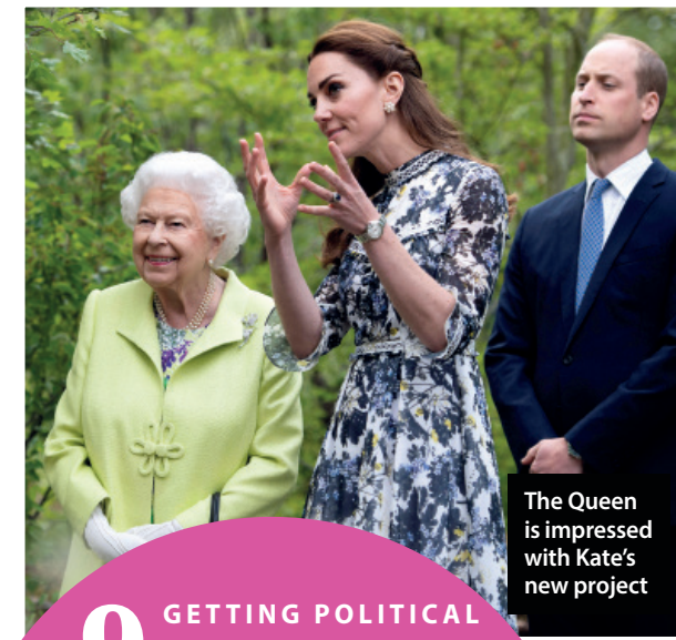
The Queen is impressed with Kate's new project

One of Kate's most recent projects was her Chelsea Flower Show Garden, called 'Back to Nature'. Once it was complete, she and William gave his grandmother a grand tour and she appeared delighted by the green space. Insiders commented that since the Queen is a Patron of the Chelsea Flower Show, it went some way to earning Kate some Brownie points with the Monarch.