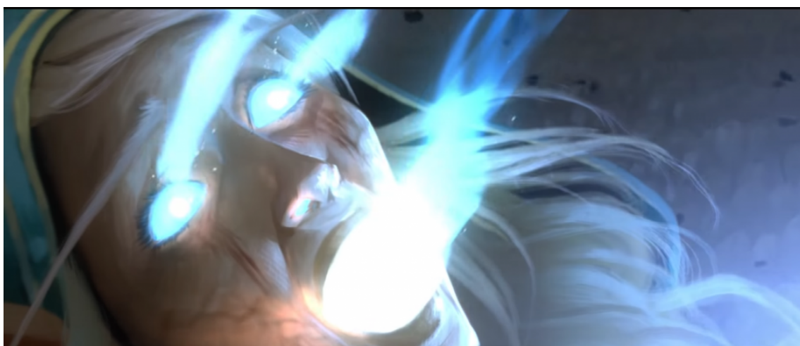
Sylvanas as her soul is being ripped out

After his corruption by the runeblade Frostmourne, Arthas becomes the Lich King and a death knight. This is where it gets ugly. In the battle in W3, Arthas kills Sylvanas and rather than giving her an honorable death, he turns her into a banshee. Sylvanas was strong enough to fight the demonic possession from the Lich King and aided in battling against him. How her soul must have been tortured to have not only been betrayed and killed by her love but then to be part of the disposing of his evil. After Arthas' death, Sylvanas realized that her eventual demise would only lead to an eternity of darkness and torture in the afterlife.