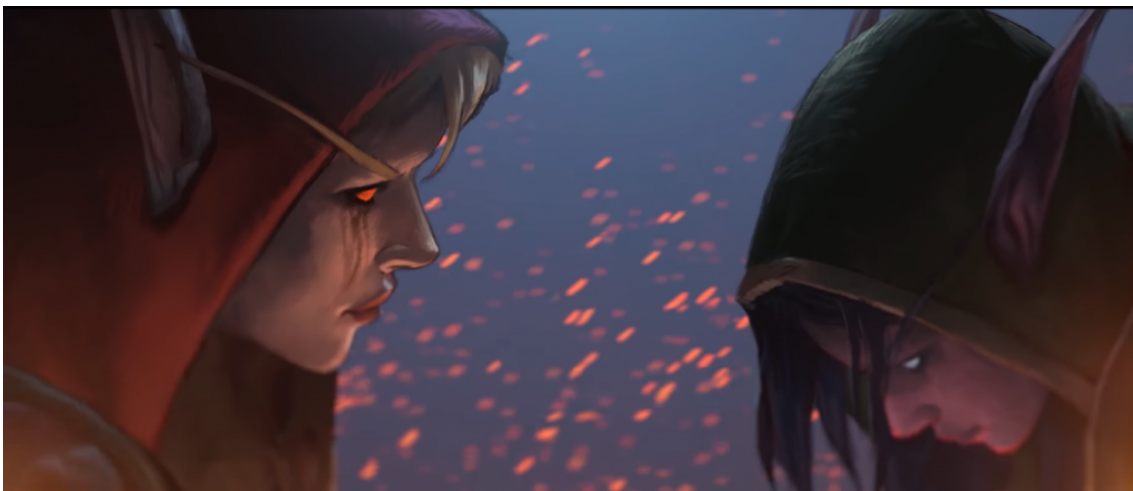
Sylvanas and dying Night Elf talk

In this video, Sylvanas heartlessly orders the burning down of the World Tree in Teldrassil, even though only Night Elf citizens were left. All in the name of war. What...the...actual...f***?!?!? Fans and veteran players were shocked and horrified after witnessing their beloved Dark Lady being so malicious and, yes, even childish. Her dialog with a dying night elf (her former racer) appears to be filled with hatred and rage for the living and not just another war.