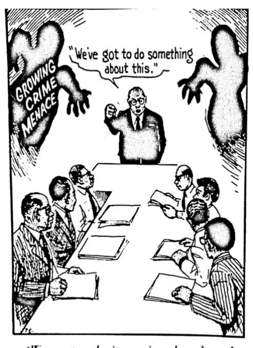
'We must make it so crime doesn't pay' (The Washington Afro-American, January 18, 1975) Forman Jr., p. 52

Another interesting example of the domination and reversal of public opinion by powerful black leaders can be found in the two cartoons below: