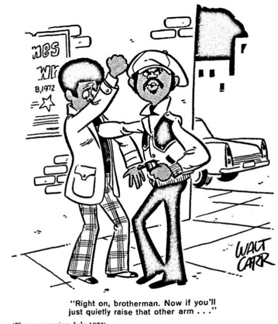
(Ebony magazine, July 1973)

characters are drawn so similarly they could even be brothers—which the artist pushes further by having his robber call the victim "brotherman." The idea here is that while guns were initially used by African Americans to save black lives, they began to be used to end black lives disproportionately as various drug epidemics ravaged black communities in the twentieth century. Although black leaders like Ida B. Wells and Malcolm X once endorsed guns and hailed the arrival of the "New Negro" (68) who owned