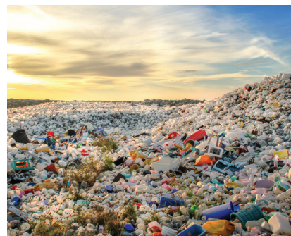
▲ Single-use plastic waste has become a significant environmental issue as it clogs landfills and pollutes the ocean, where it can persist for hundreds of years.