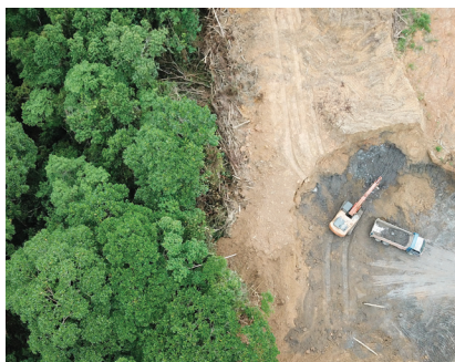
▲ Deforestation and degradation are still significant issues in areas where illegal logging is common. Every minute, the world loses the equivalent of 27 soccer fields of forest.

Companies also often use wood residuals from saw mills and furniture factories to make paper, as well as