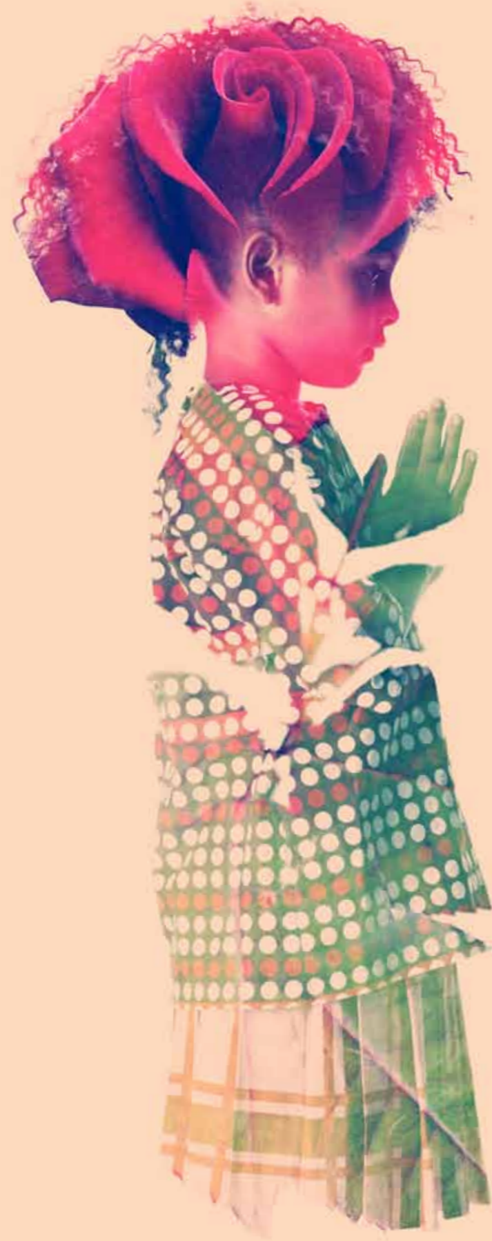
THIS PAGE Spotted top £190 and check skirt £150, both by Marni (ages 2–12). OPPOSITE PAGE Flower print top £265 by Dolce & Gabbana (ages 2–10); orange zebra print cardigan £55 by Mini Rodini (ages from birth–11 years); corsage £120 by Roma e Toska