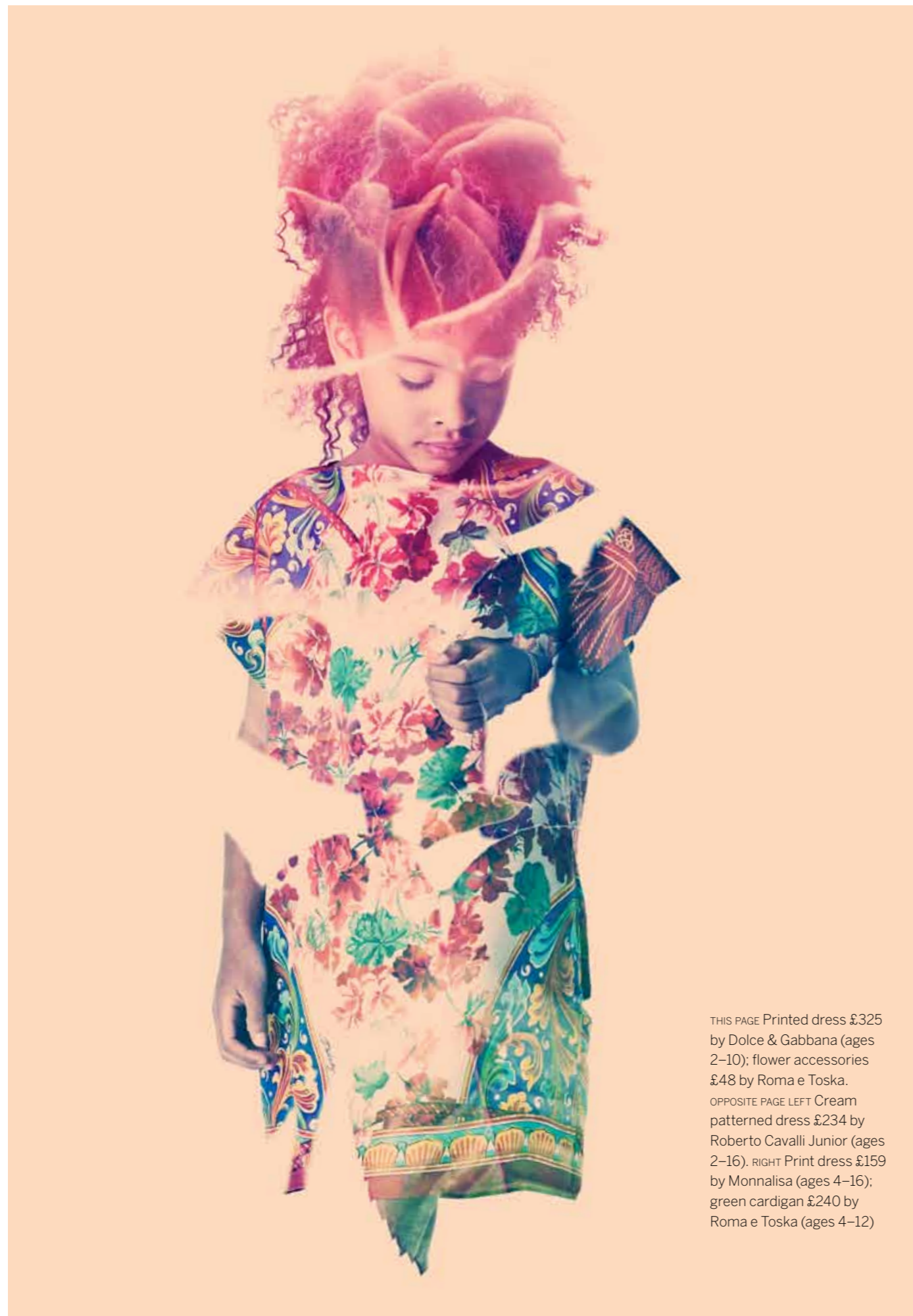
THIS PAGE Printed dress £325 by Dolce & Gabbana (ages 2–10); flower accessories £48 by Roma e Toska. OPPOSITE PAGE LEFT Cream patterned dress £234 by Roberto Cavalli Junior (ages 2–16). RIGHT Print dress £159 by Monnalisa (ages 4–16); green cardigan £240 by Roma e Toska (ages 4–12)